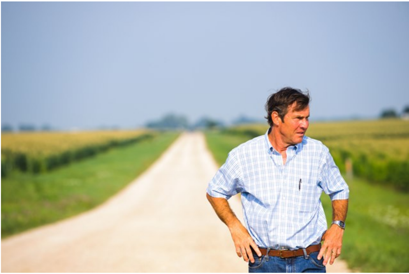
At Any Price

Published on HollywoodChicago.com (http://www.hollywoodchicago.com)