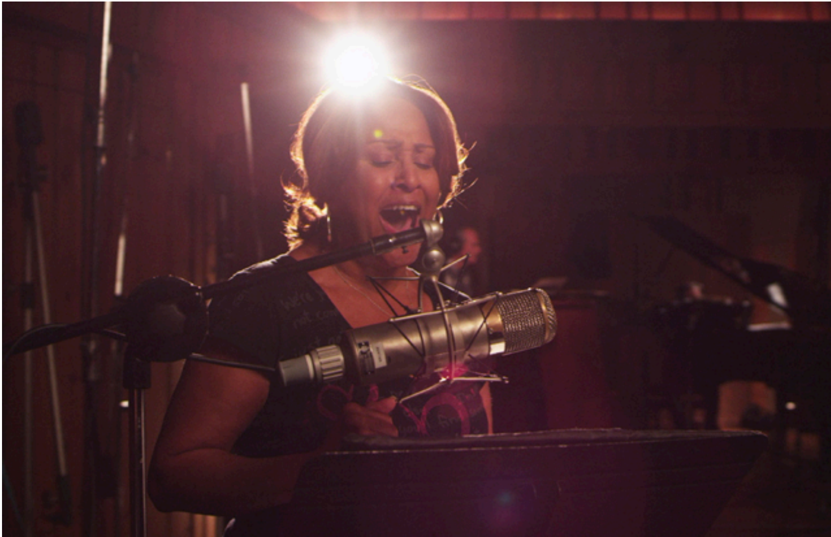
In the Spotlight: Darlene Love in '20 Feet from Stardom'