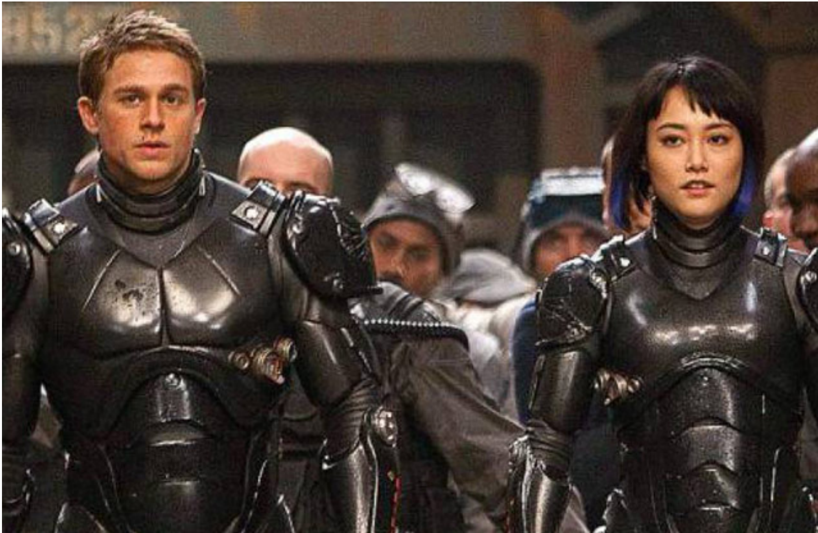
Jaeger Bombers: Raleigh (Charlie Hunnam) and Mako Mori (Rinko Kikuchi) in 'Pacific Rim'