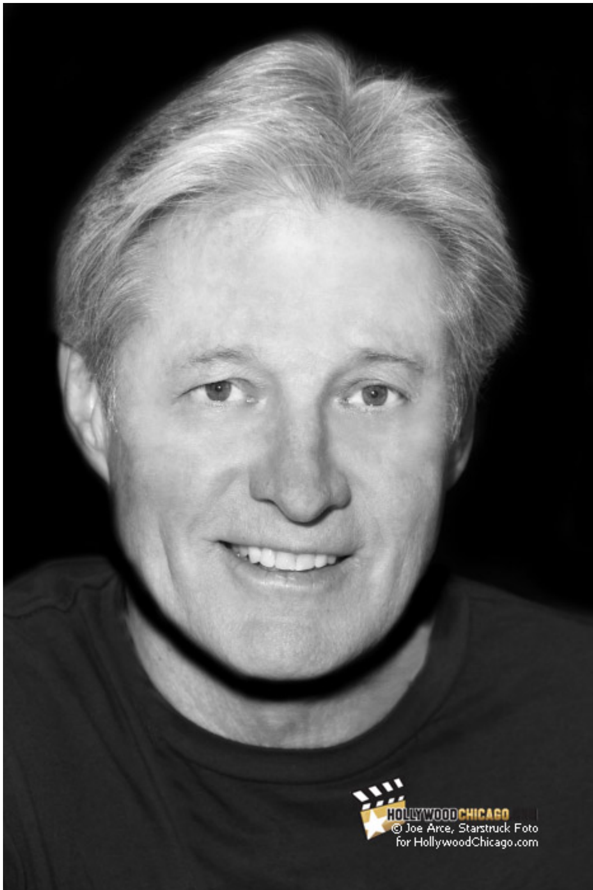
Bruce Boxleitner at 2013 C2E2, on April 26th in Chicago

HollywoodChicago.com talked to Bruce Boxleitner at C2E2, where he plans to give a presentation seminar on the new series, autograph memorabilia and meet fans.