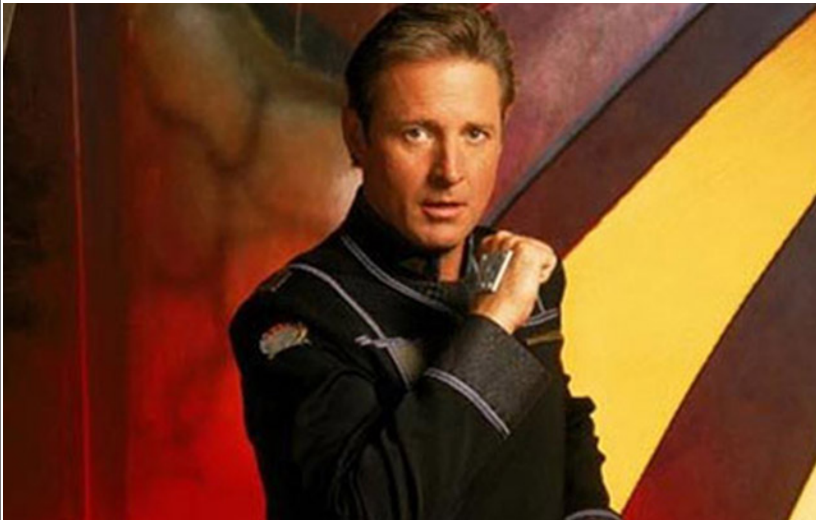
Bruce Boxleitner as Capt. John Sheridan in 'Babylon 5'

Boxleitner: Because the imagination for such tales is without limit. I think now that science fiction is so much more mainstream, whereas in the middle part of the 20th century it was more oriented towards kids. In Hollywood, all the powerful producers of today – like Steven Spielberg – they loved sci-fi when they were kids. So now the genre is treated with reverence, and films like 'Avatar' and 'The Dark Knight' are nominated for Best Picture Oscars. It has finally come into its own, in a grown-up way.