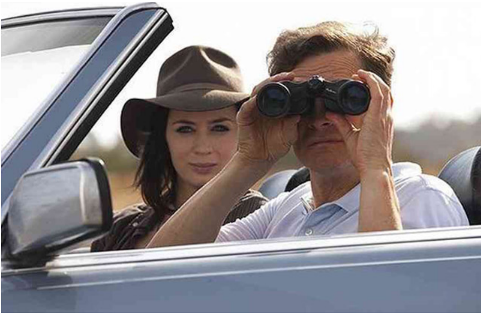
Looking for Identity: Mike (Emily Blunt) and Arthur in ‘Arthur Newman’