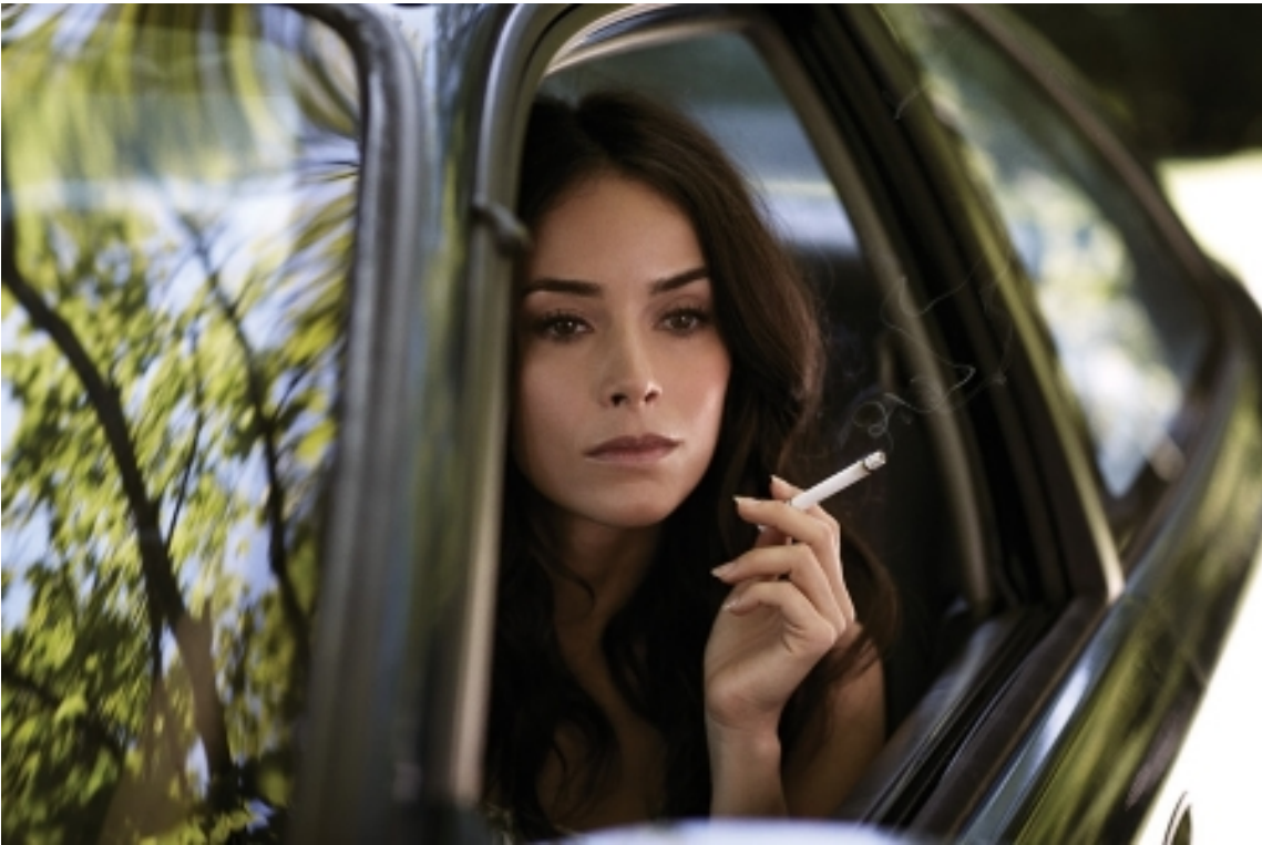
Rectify