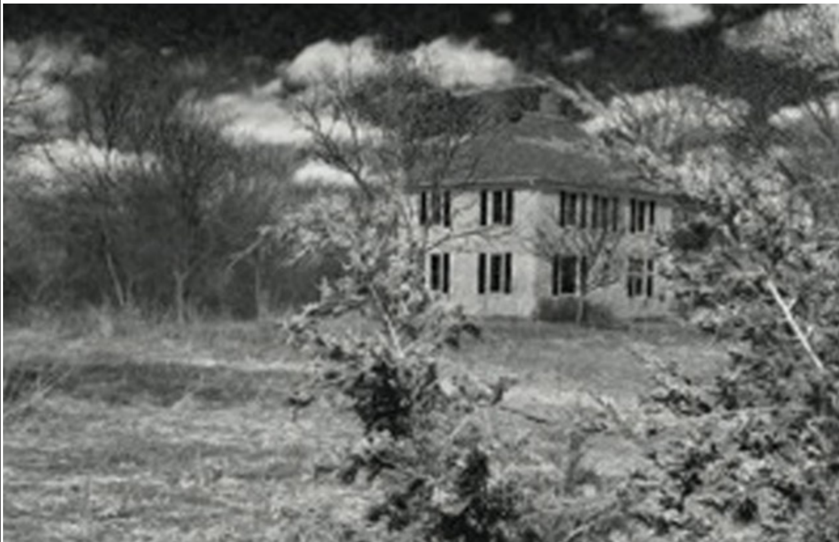
Promotional Photo for “The Other One”