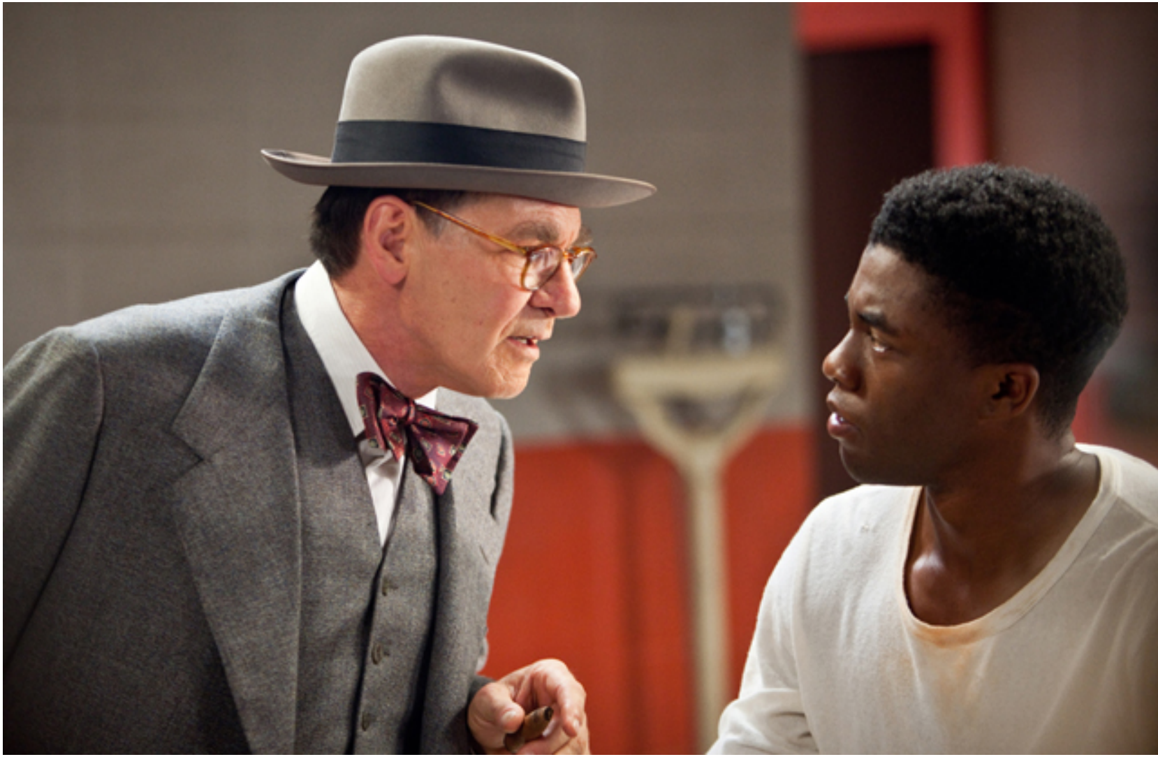
Branch Rickey (Harrison Ford) Advises Jackie Robinson (Chadwick Boseman) in '42'