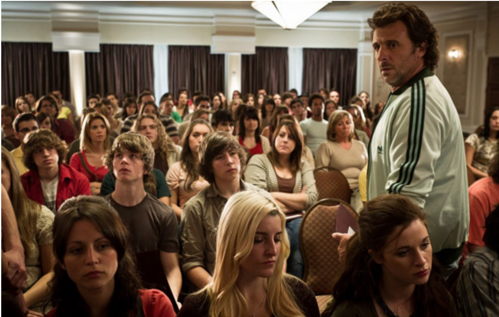
Father's Day: David (Patrick Huard) Contemplates His Fate in 'Starbuck'

★ Continue reading for Patrick McDonald's full review of "Starbuck" [14]