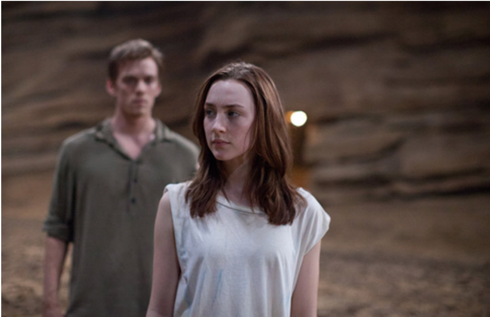
Who Do You Love?: Melanie/Wanda (Saoirse Ronan) and Jared (Max Irons) in ‘The Host’