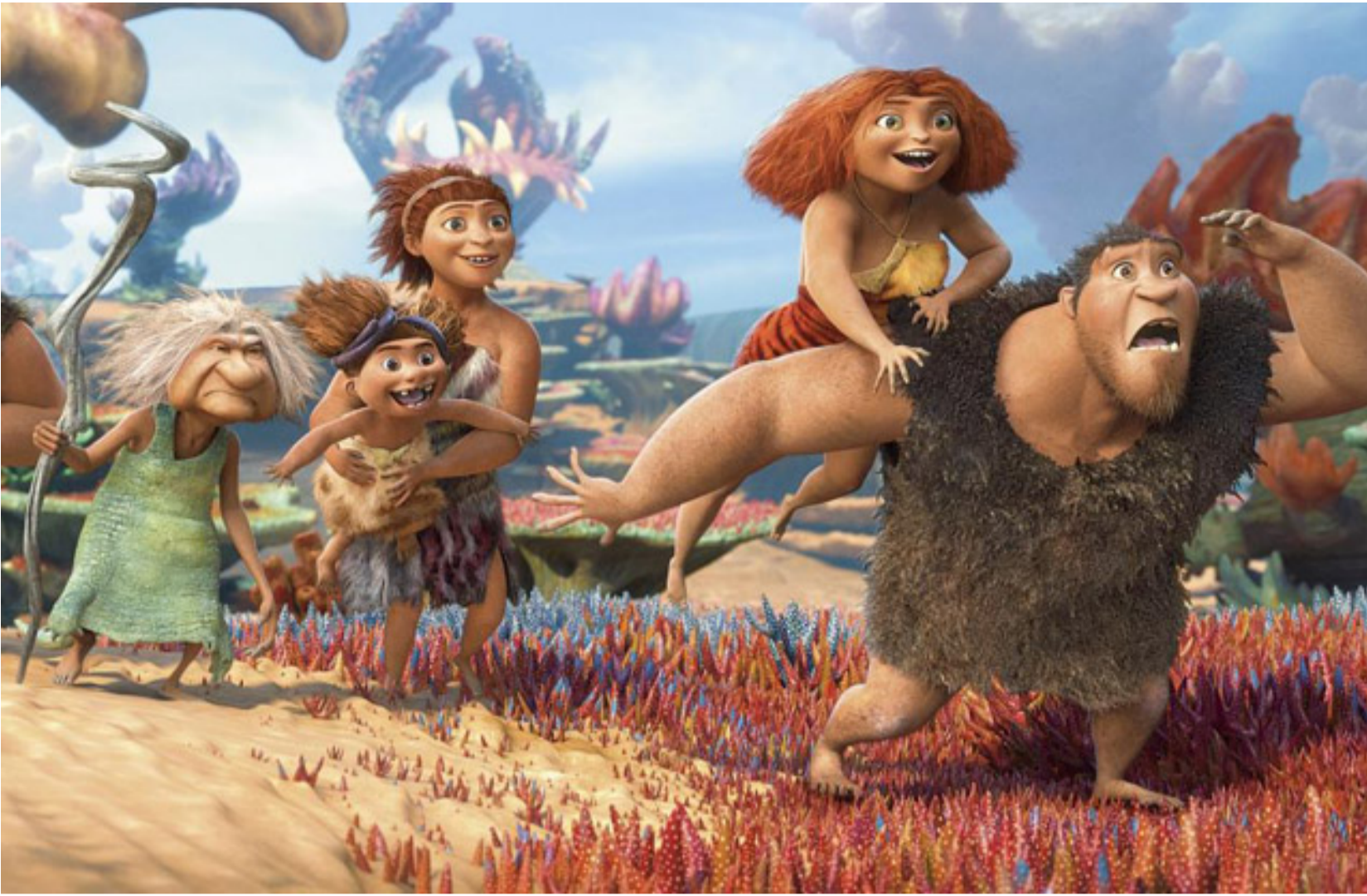
Meet 'The Croods'

★ Continue reading for Patrick McDonald's full review of "The Croods" [15]