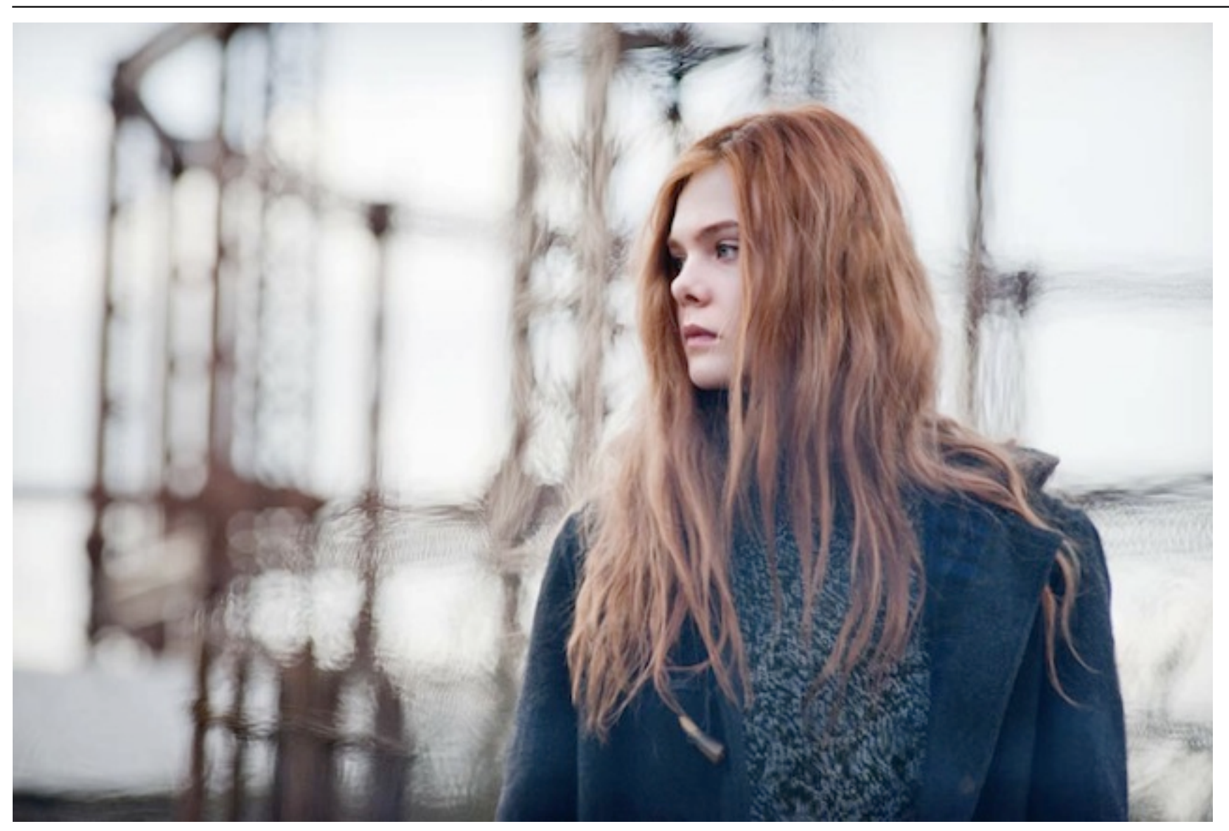
Elle Fanning stars in Sally Potter's Ginger and Rosa.

Published on HollywoodChicago.com (http://www.hollywoodchicago.com)