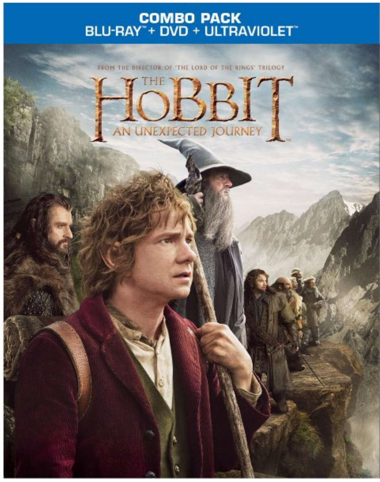
The Hobbit: An Unexpected Journey was released on Blu-ray and DVD on March 19, 2013