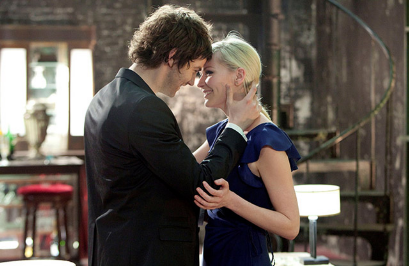
Lovers Adam (Jim Sturgess) and Eden (Kirsten Dunst) Reunite in ‘Upside Down’