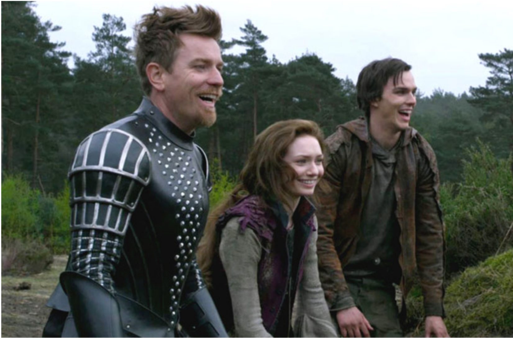
Ewan McGregor (Elmont), Eleanor Tomlinson (Isabelle) and Nicholas Hoult (Jack) in ‘Jack the Giant Slayer’