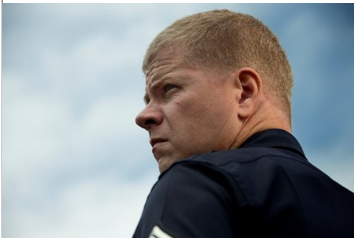
Southland