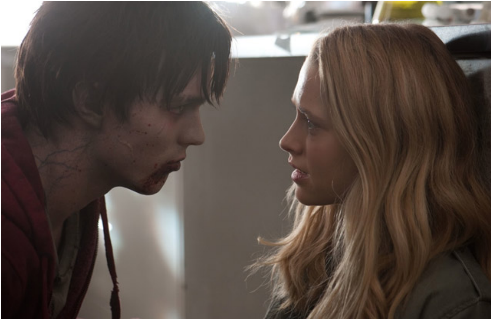
Feed Dating?: R (Nicholas Hoult) and Julie (Teresa Palmer) in “Warm Bodies”