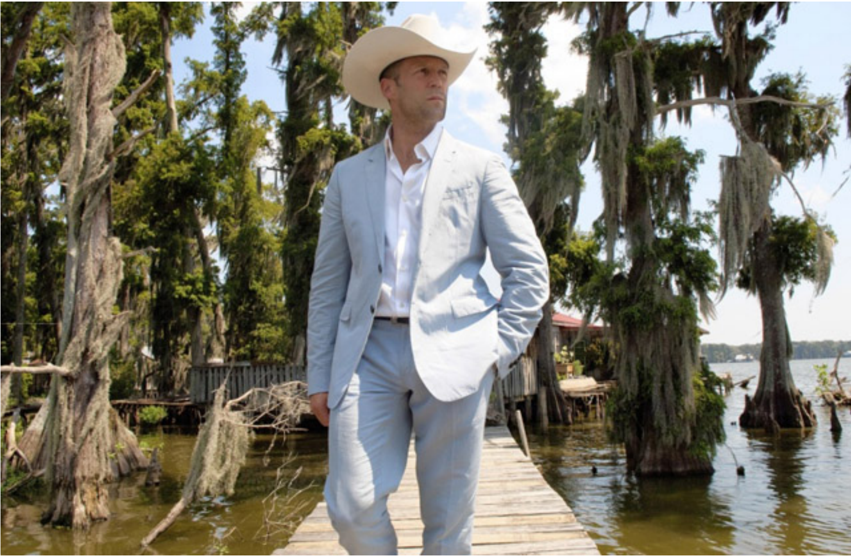
Parker (Jason Statham) Tries Out His Texas Accent in ‘Parker’