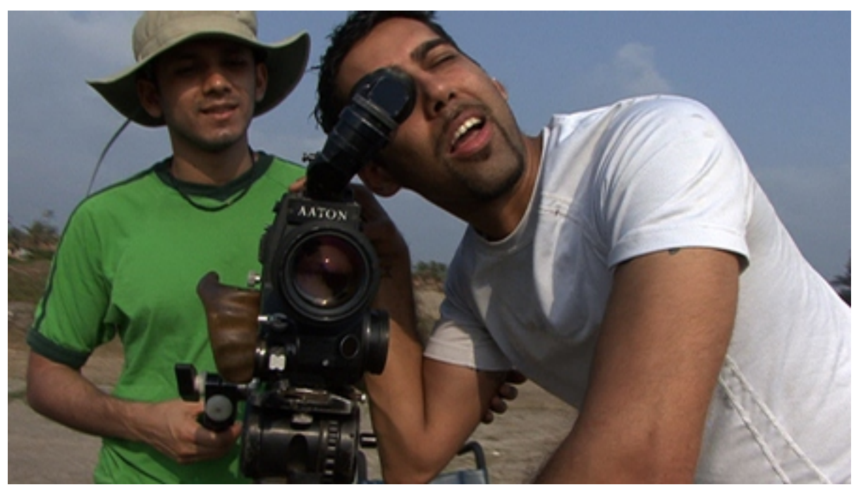
When I Walk