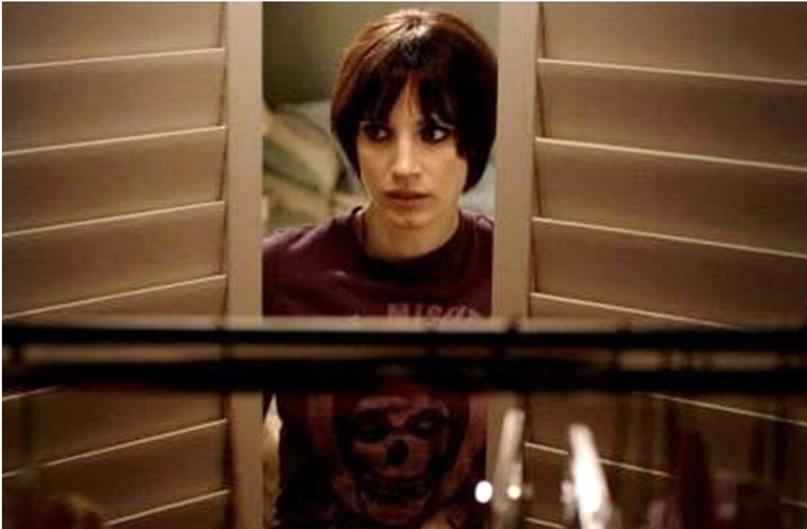
Annabel (Jessica Chastain) Checks the Dark Corners in 'Mama'