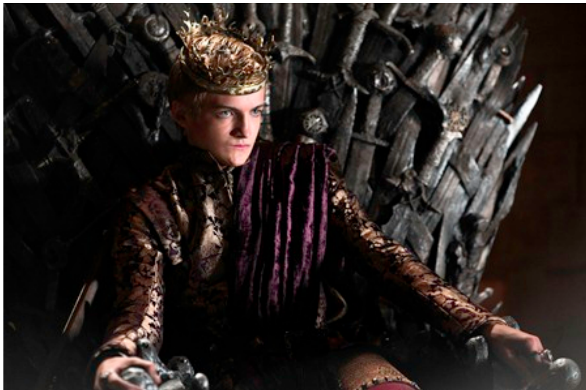
Game of Thrones

Is there any show on TV more dramatically ambitious than “GoT”? It’s one of those shows that is really hard to believe is even on TV. It’s like “LOST” in that respect, in that not only should it not really work but it’s hard to believe it was ever greenlighted. “We’re gonna make an incredibly expensive show with dozens of major characters in fantasy settings and make it more about politics and leadership than dungeons & dragons. Sound good?!?” And yet it has become one of the smartest and most technically accomplished programs of the last decade. The second season was a little dense at times but it peaked to a point of dramatic perfection. I can’t wait for season three. (Season 1 is on Blu-ray & DVD and Season 2 is on HBO Go.)