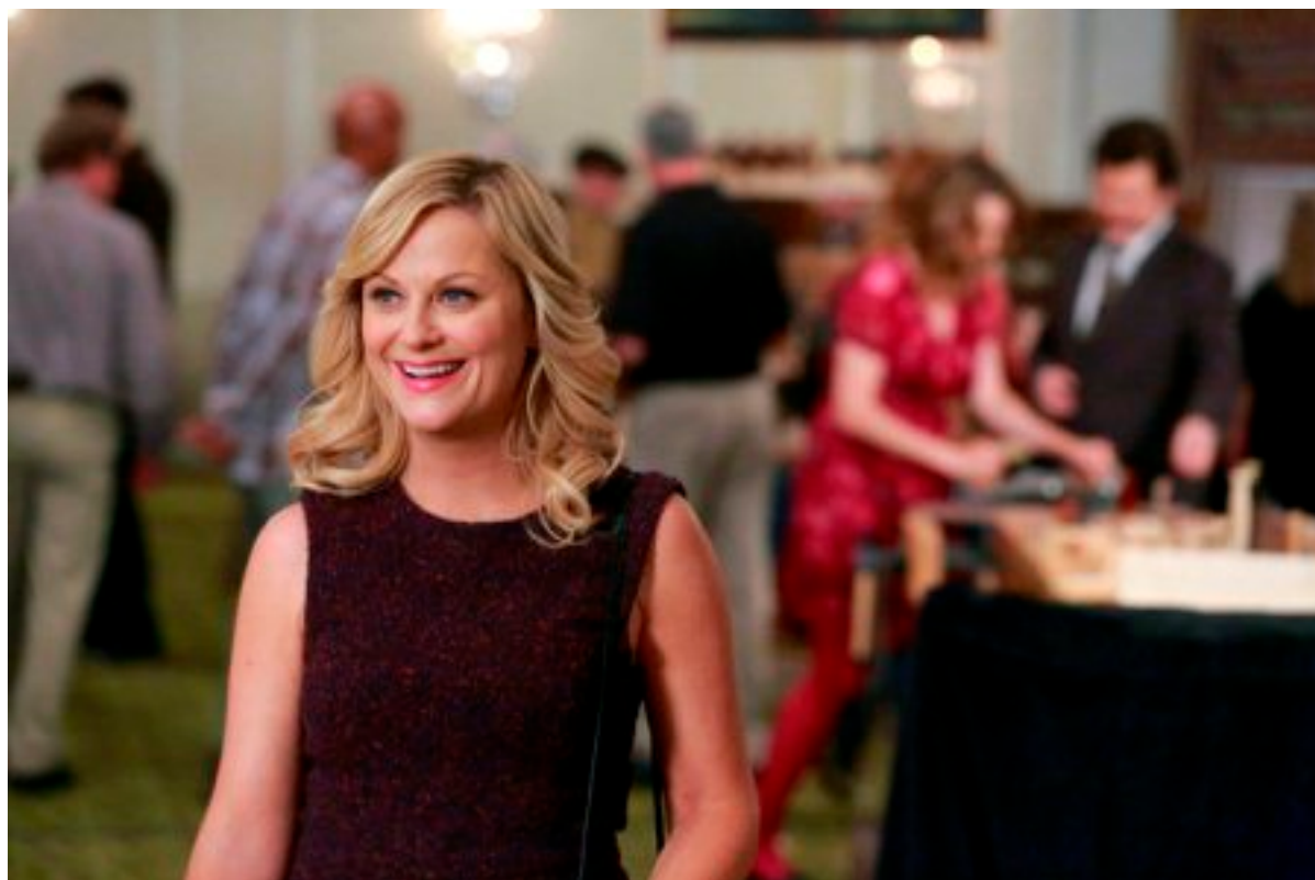
Parks and Recreation