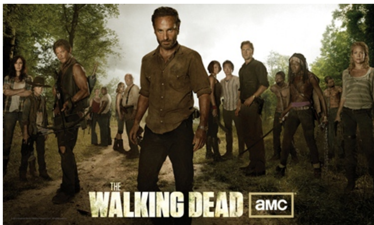
The Walking Dead

—Episode 2.13, “Beside the Dying Fire,” 3.18.12