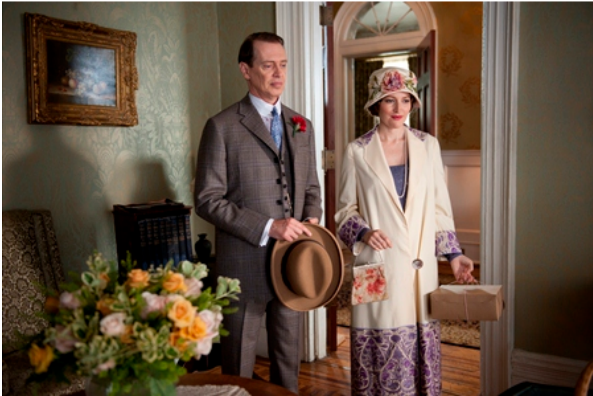
Boardwalk Empire

“We’ve been on the road for 18 hours. I need a bath, some chow and then you and me sit down and we talk about who dies.” —Episode 3.11, “Two Imposters,” 11.25.12