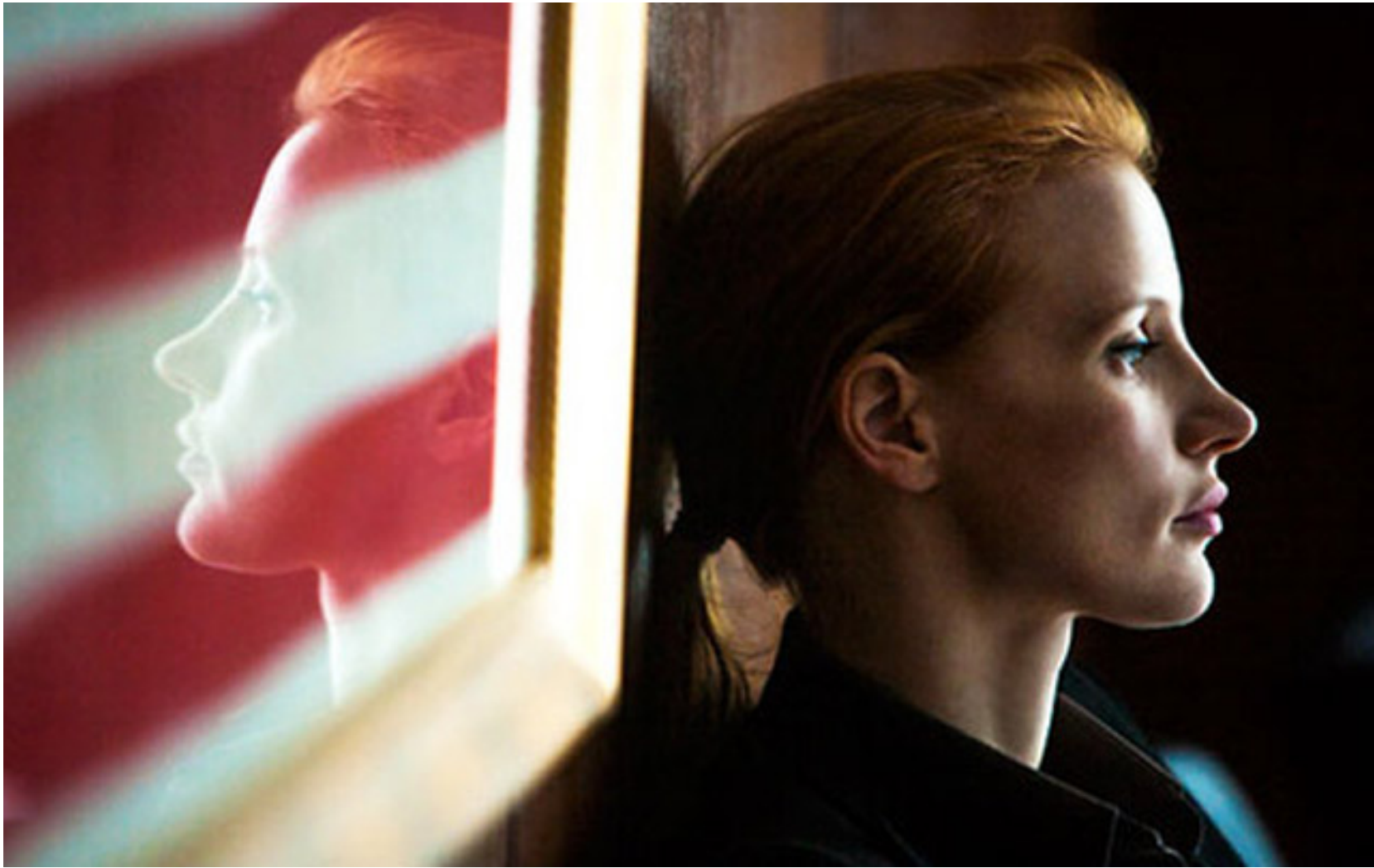
Jessica Chastain is CIA Operative Maya in ‘Zero Dark Thirty’