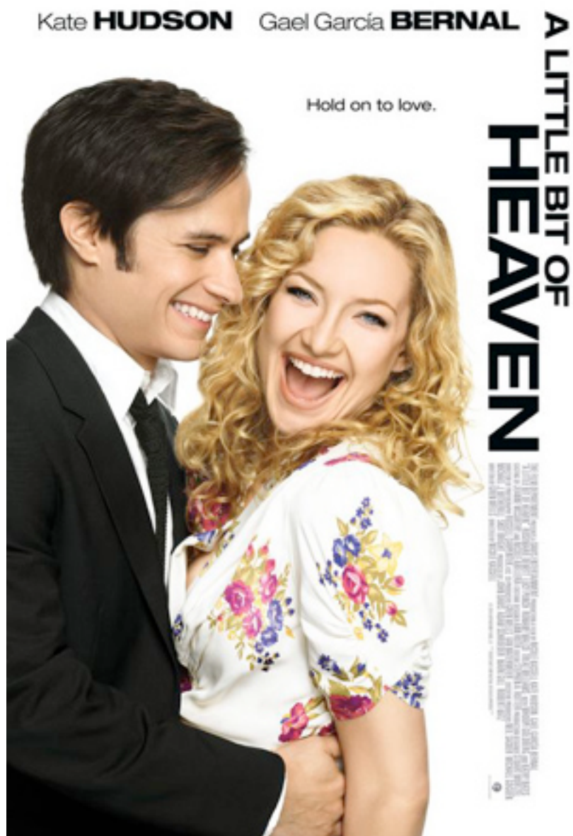
A Little Bit of Heaven