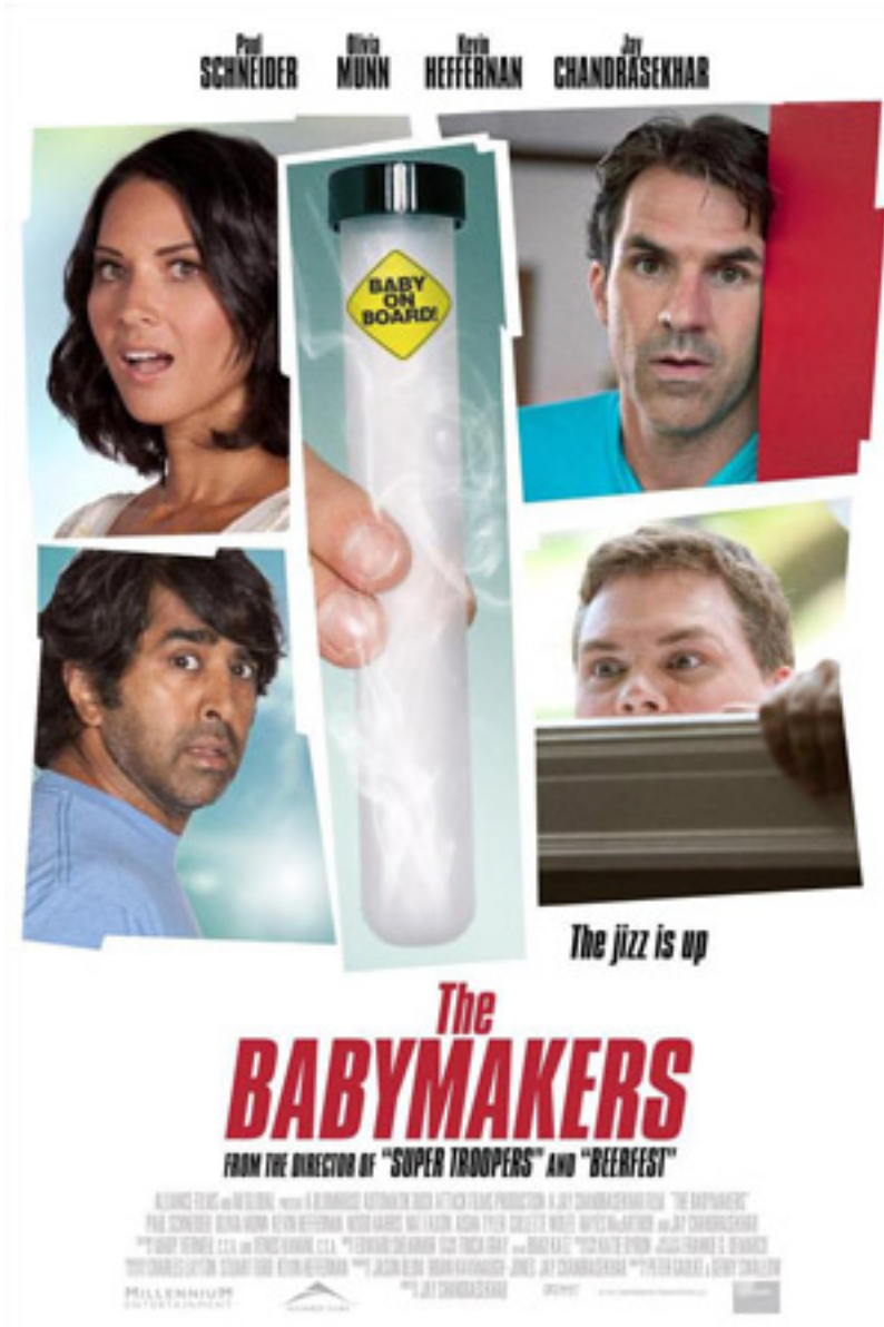
The Babymakers

One of the most uncomfortable “elephant in the room” circumstances is a couple who want to have babies but cannot. So let's make a comedy out of it! Hoo-Ha! This is painfully unfunny, and so forced I expected studio interns at the theaters to hit me over the head with a binky while I took it in. The story line morphs into a heist picture, as better to give director Jay Chandrasekhar a small part as a stereotype from India. What are the wacky boys from the Broken Lizard comedy troupe trying to steal? Seminal fluid from the sperm bank. It's a comedy that keeps on coming, I mean giving.