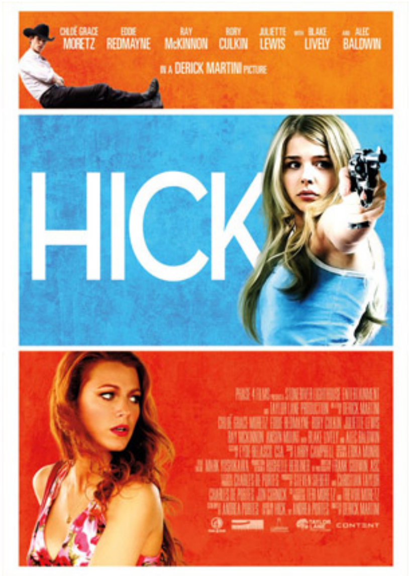
Hick

I’m ready to join the Daughters of the Confederacy after seeing this travesty, or at least have empathy for southerners as they watch actors like Eddie Redmayne (British) and Alec Baldwin (Long Island, New York) trying to portray their brethren. In a happy plot line, a 13-year-old girl (Chloe Grace Moretz) gets a gun for her birthday and then runs away from home, encountering her new family like Dorothy in the Land of Oz. But there is no pot of gold over this rainbow, as the film consists of leering stereotypes (Redmayne), a creepy Lolita sense for Moretz and a screaming-all-my-lines Oscar baiter (Juliette Lewis). Everything you need to know about this film is that Baldwin – Alec Baldwin – portrays a guy named Beau.