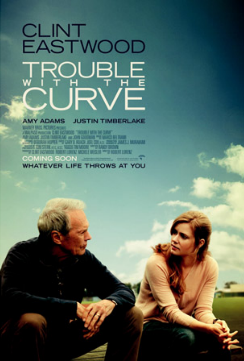
Trouble with the Curve

REDEEMING FACTOR: Almost everyone who you quickly grow to hate in “Piranha 3DD” dies in brutal ways. There’s a small bit of joy in watching stupid characters die in stupid ways. One only wishes the filmmakers would get in on the action. BT