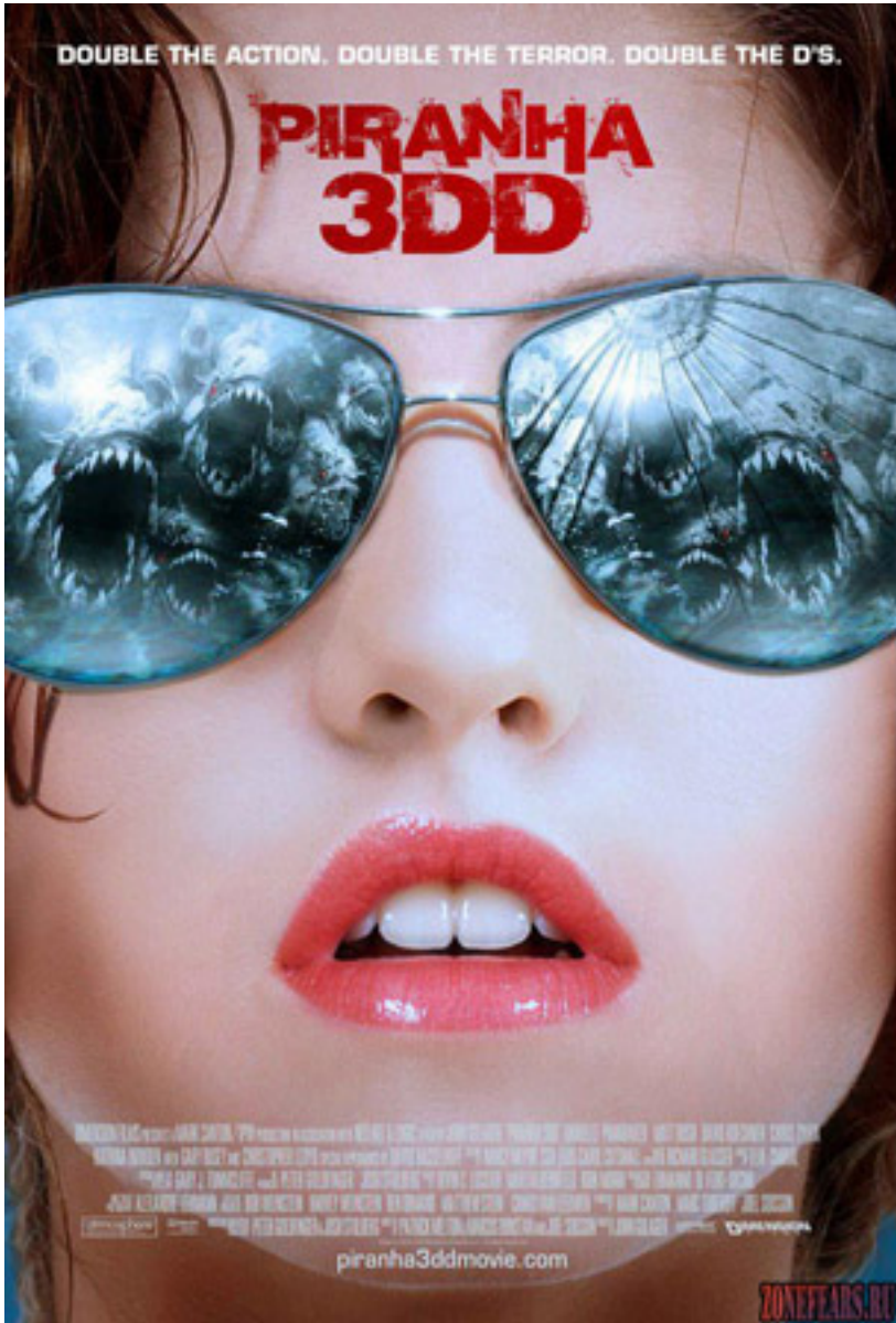
Piranha 3DD

Dumb, dumb, dumb. What did we learn here? Tongue-in-bloody-cheek gore-fests like the first “Piranha 3D” are nowhere near as easy as they look. Alexandre Aja’s first film looks like a genre masterpiece compared to this terminally unfunny piece of fish crap that completely misjudges the balance between character, humor, and horror, producing none of the above. David Hasselhoff isn’t even believable playing himself and