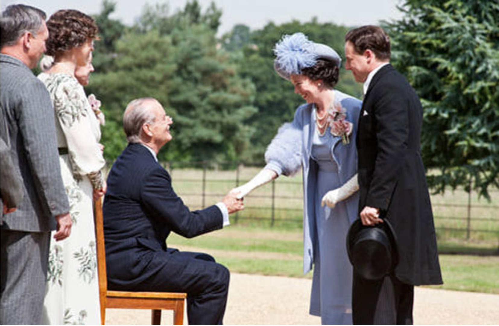
Don't Get Up: FDR (Bill Murray), Elizabeth (Olivia Colman) and George VI (Samuel West) in 'Hyde Park on the Hudson'