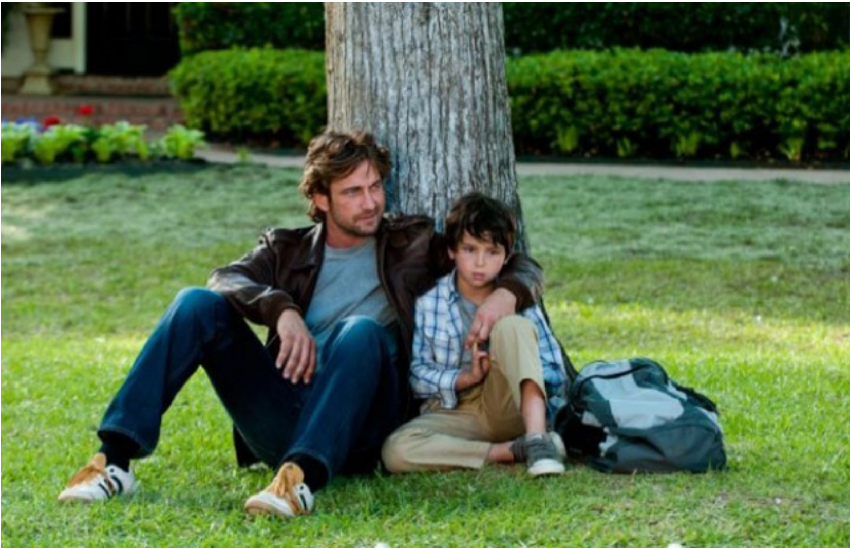
Players: George (Gerard Butler) and Son Lewis (Noah Lomax) in ‘Playing for Keeps’