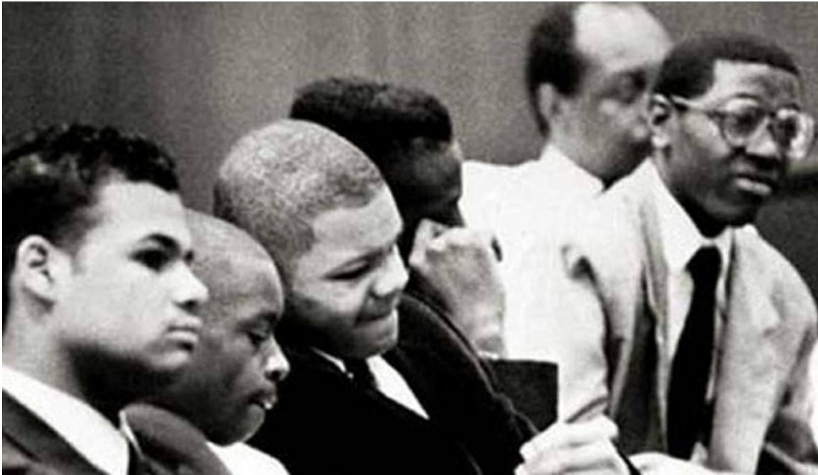
Raymond Santana, Antron McCray, Kevin Richardson, Kharey Wise and Yusef Salaam are 'The Central Park Five'