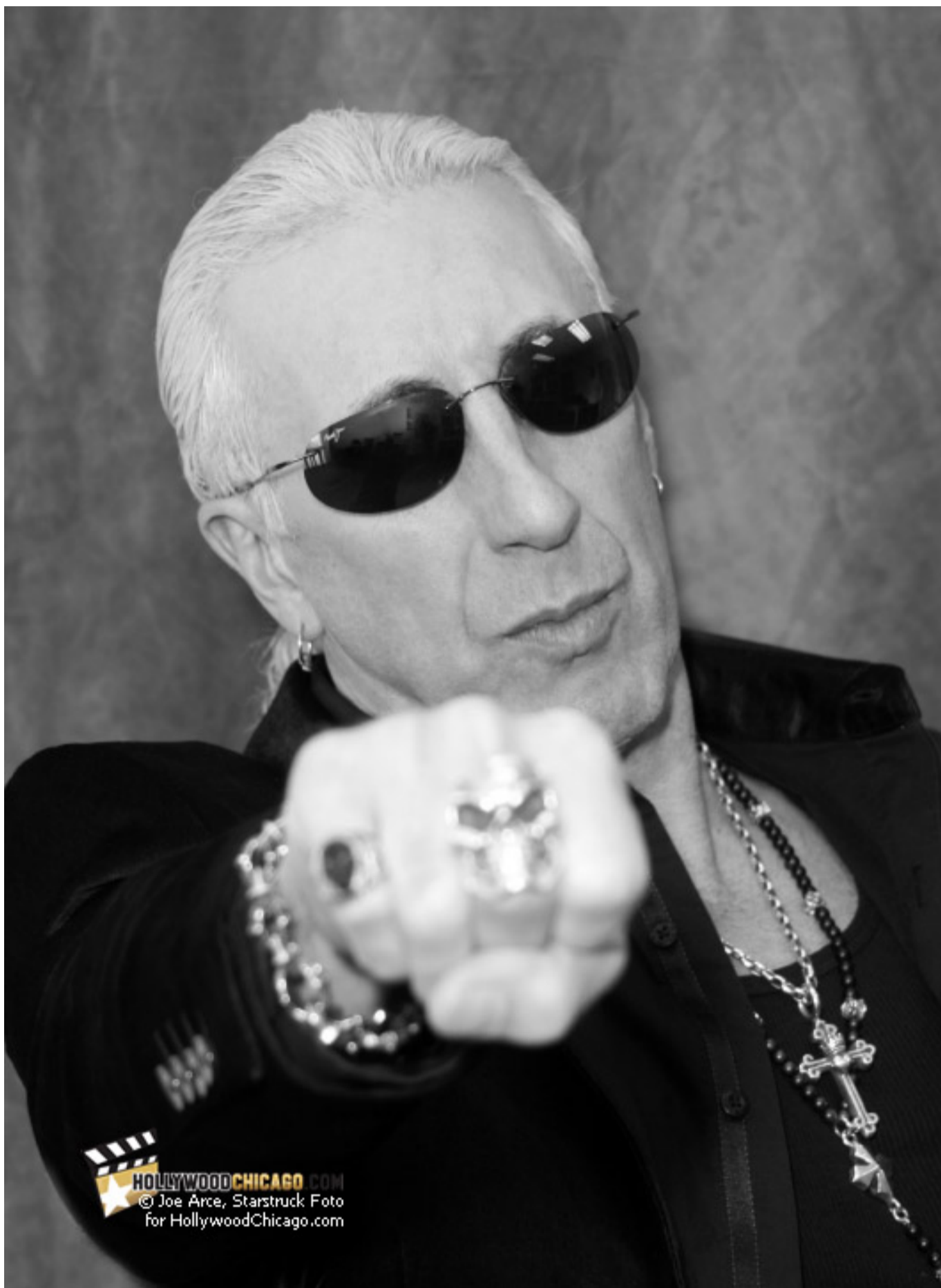
Another view of Dee Snider Promoting his Book 'Shut Up and Give Me the Mic'

HollywoodChicago.com: When you write music, are you a phrase guy – like a particular phrase comes into your head and you run with it, or are you a lyrics or melody first guy. How did you structure, for example, the anthem 'We're Not Gonna Take It'?