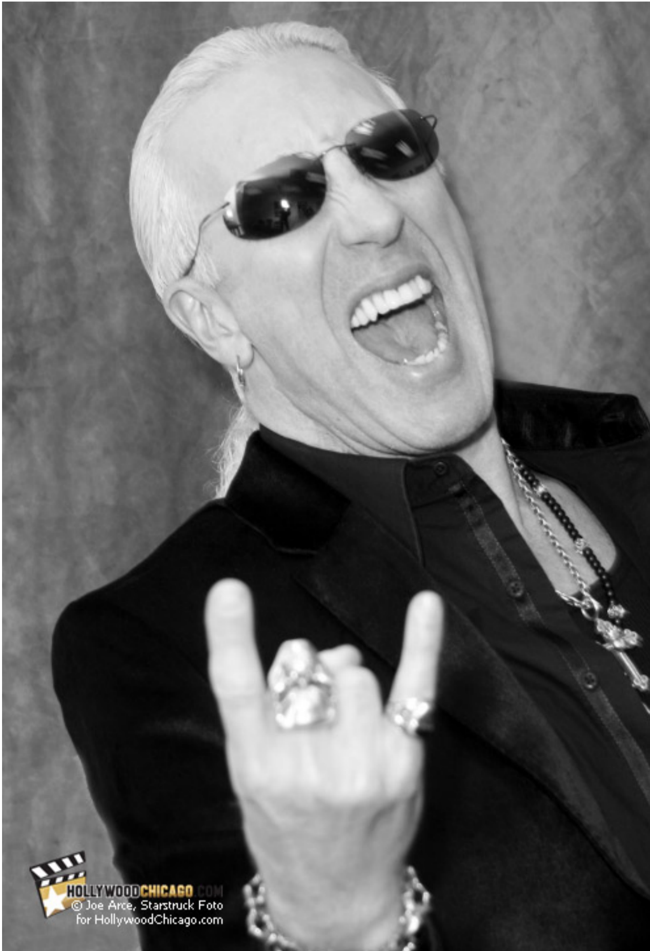
Rocker Dee Snider at the Old Orchard Barnes & Noble, May of 2012

Snider's latest book, "Shut Up and Give Me the Mic," is a memoir about his rocker days, during his time as frontman for the group "Twisted Sister" in the 1980s and his downfall a decade later, when he ended up broke after being part of one of the hottest acts in the early MTV era. Since that time, he has reinvented himself as a radio personality, voice-over artist, reality show participant, filmmaker and author.