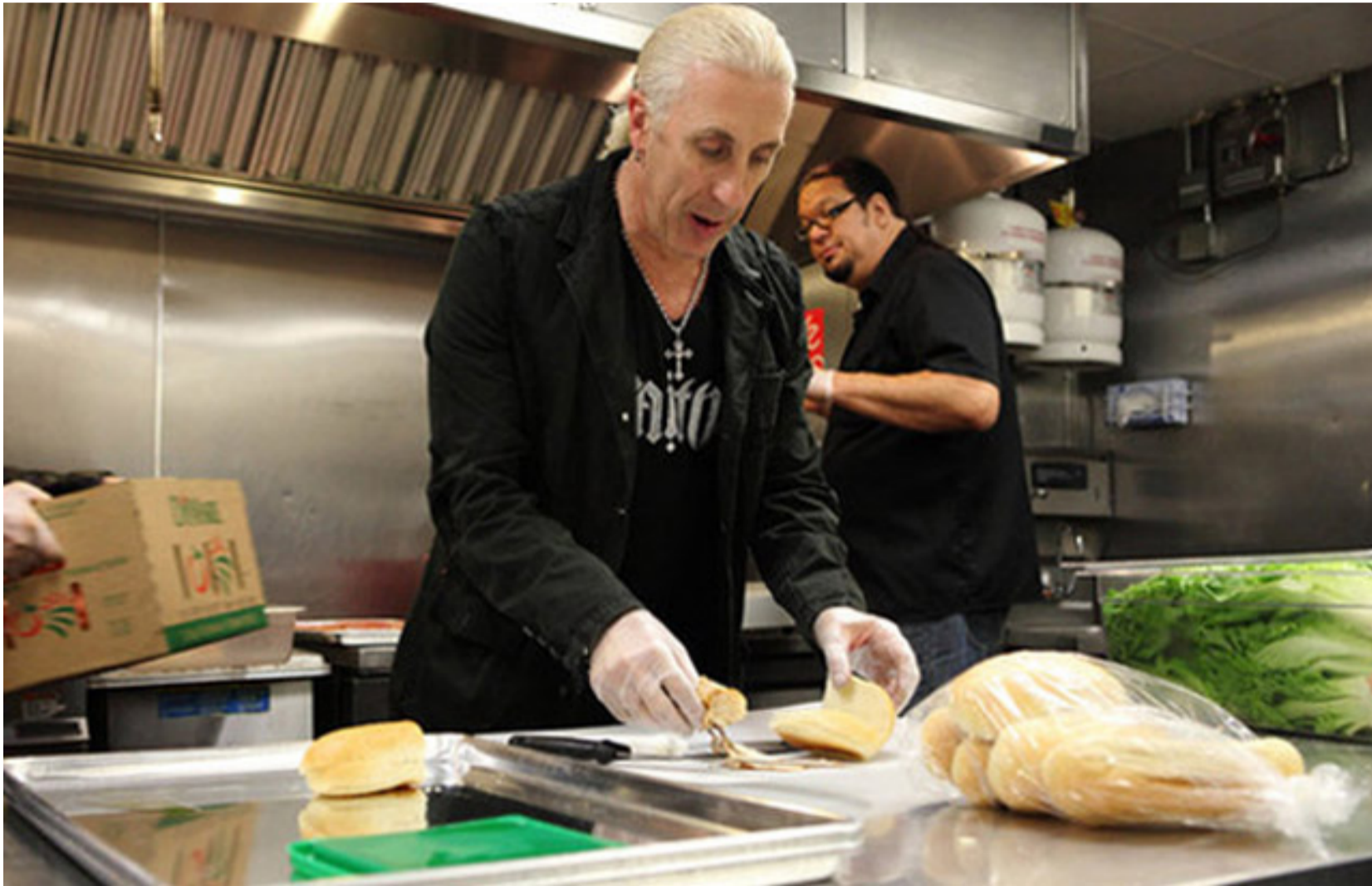
Dee Snider Works on a Challenge on 'Celebrity Apprentice'

Snider Yes. There is an manipulation, and most of the shows are scripted somewhat. Editing is a powerful, terrifying tool, the way things can appear can be completely altered. I remembered on 'Gone Country' [2008], this is not a big deal but it underlines my point – I was supposed to be at one of the events, a dinner, but I couldn't make it. But when I watched the show, I was there. I'm looking, and I thought, 'motherf**kers, they edited in another dinner.' The announcer was saying, 'Dee Snider, oddly silent.' Oddly silent? I wasn't there! One thing I picked up on quickly, is to be kind to the producers and crew. If they don't like you, you're going to pay for it. I haven't been beaten up badly.