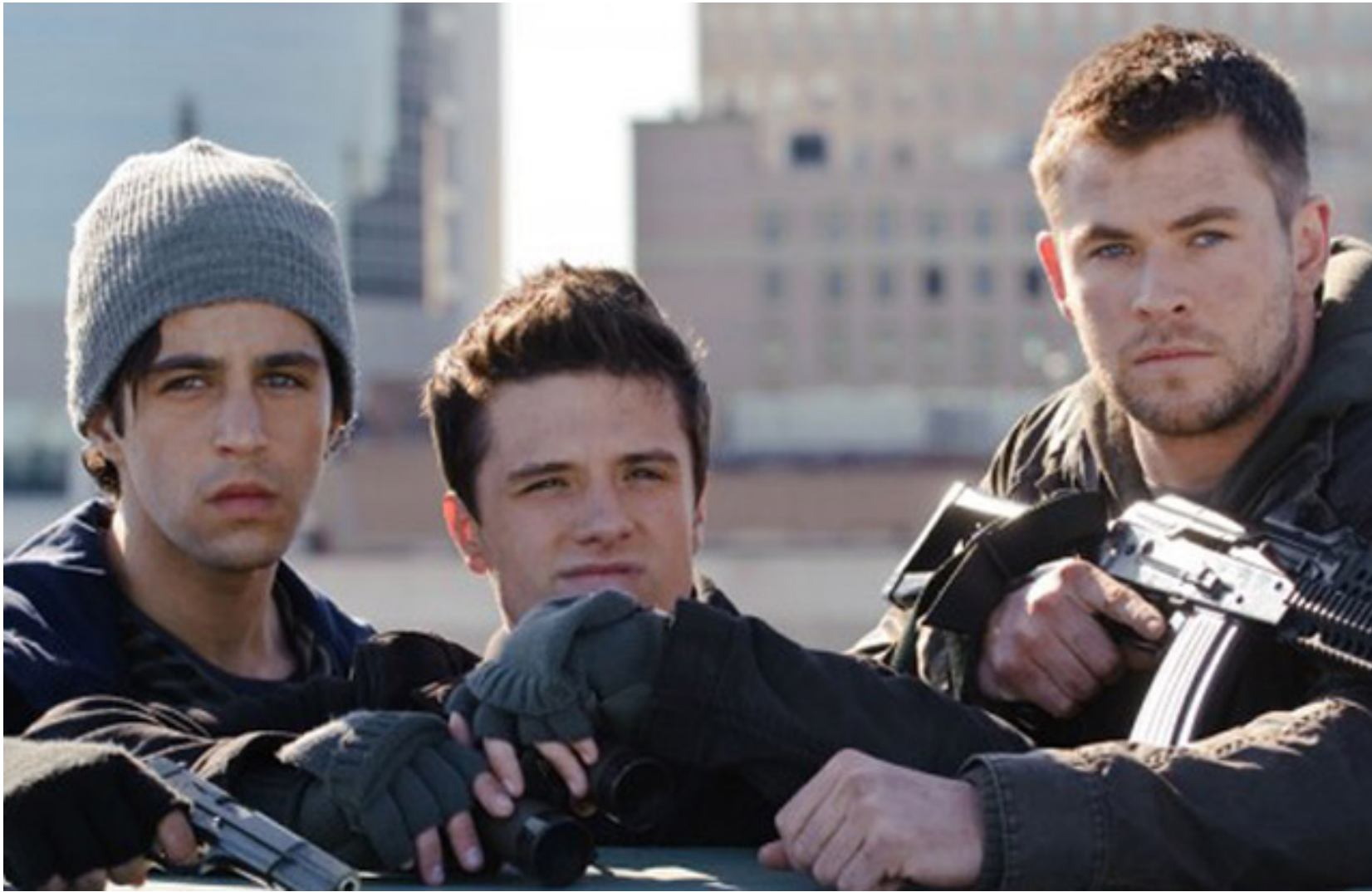
Wolverines!: Matt (Josh Peck), Robert (Josh Hutcherson) and Jed (Chris Hemsworth) in 'Red Dawn'