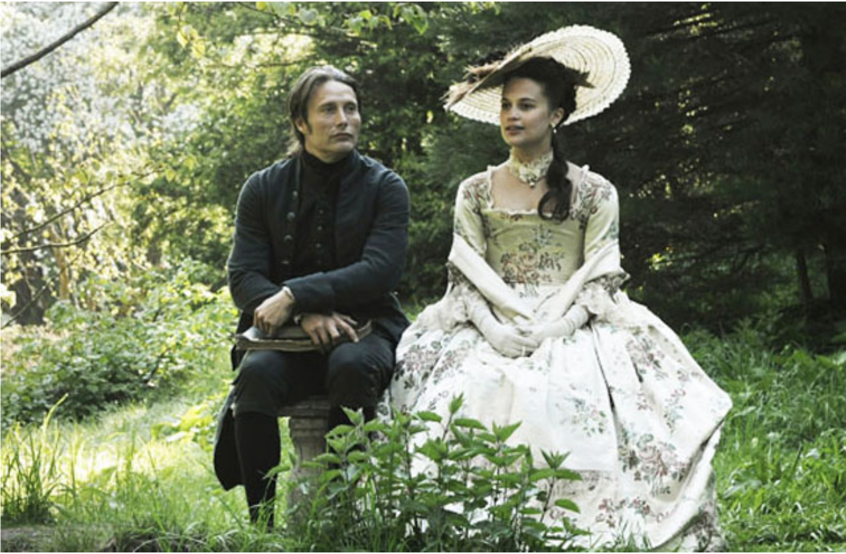
Mads Mikkelsen as Johann and Alicia Vikander as Caroline in ‘A Royal Affair’