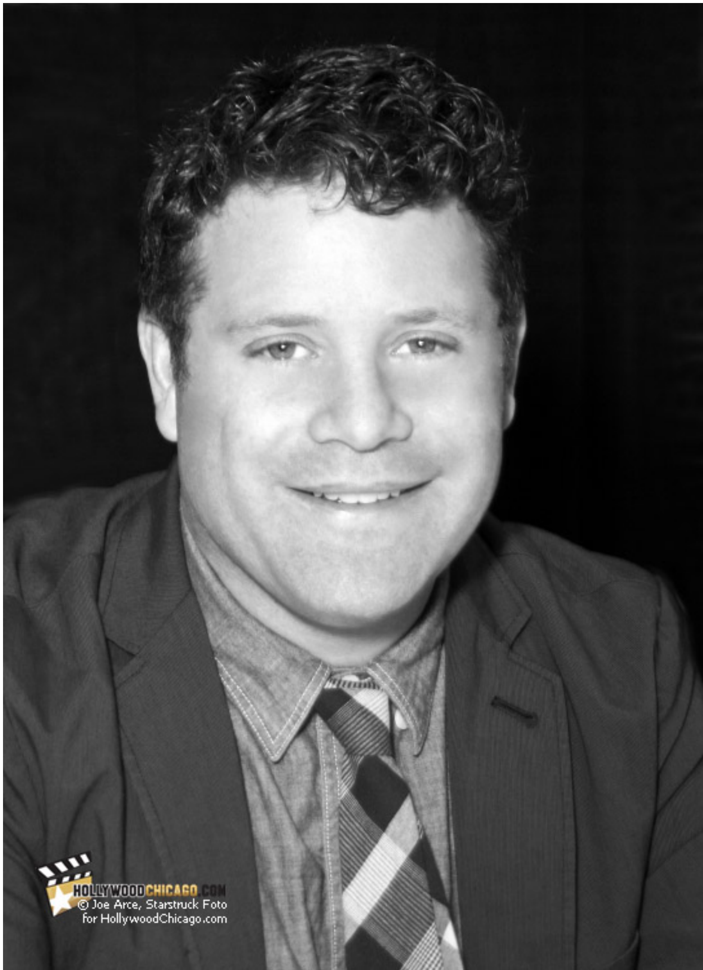
Sean Astin at C2E2 in Chicago, April, 2012