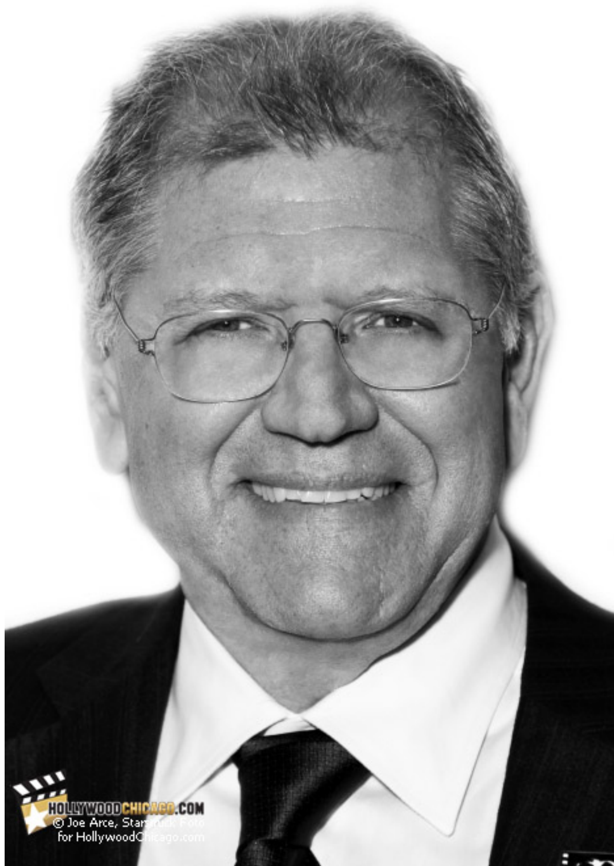
Robert Zemeckis at the Chicago International Film Festival, Oct. 25th, 2012