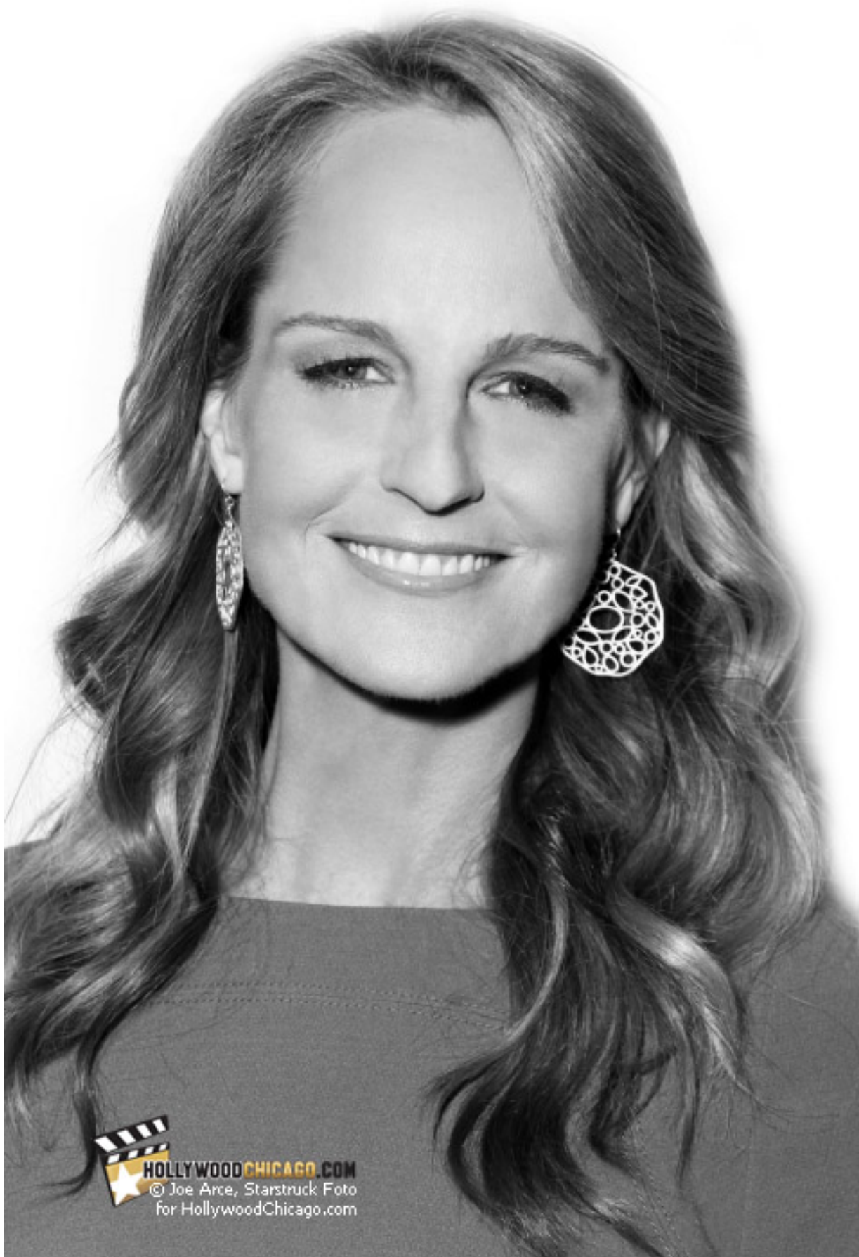
Helen Hunt at the Chicago International Film Festival, Oct. 20th, 2012, for her new film ‘The Sessions’