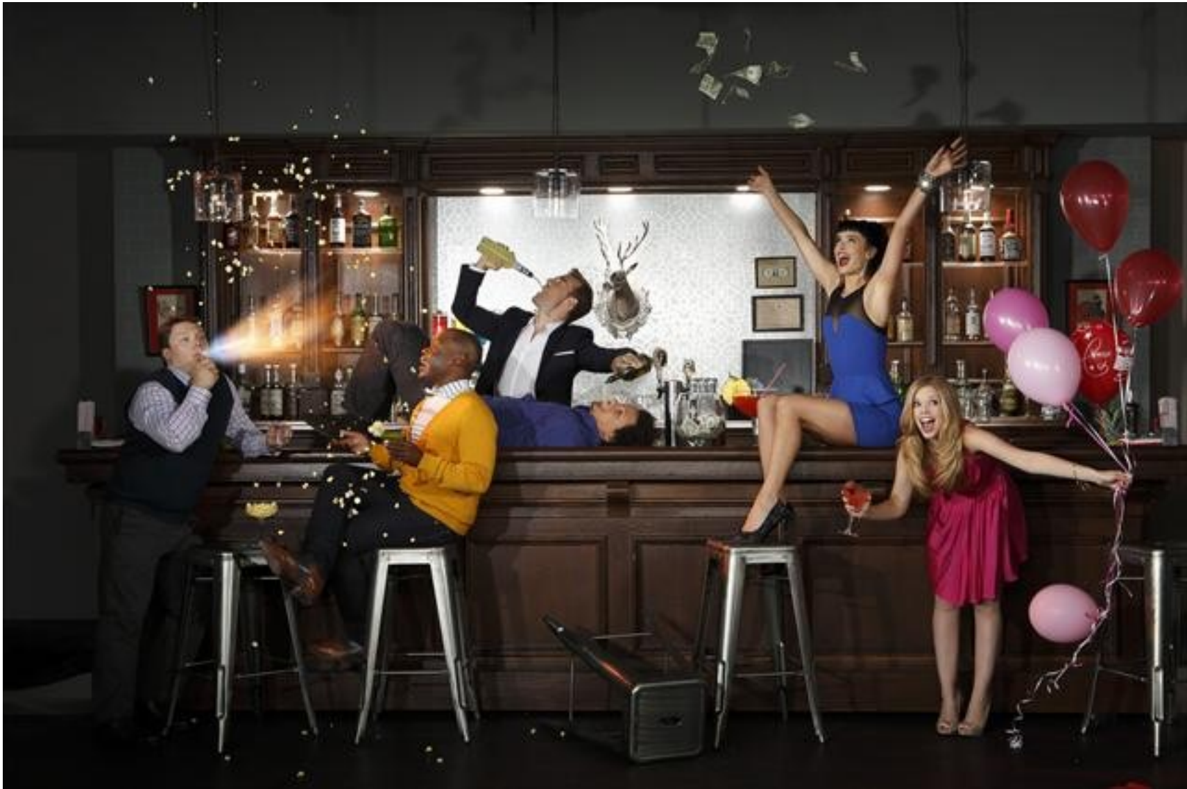
Don't Trust the B---- in Apt. 23