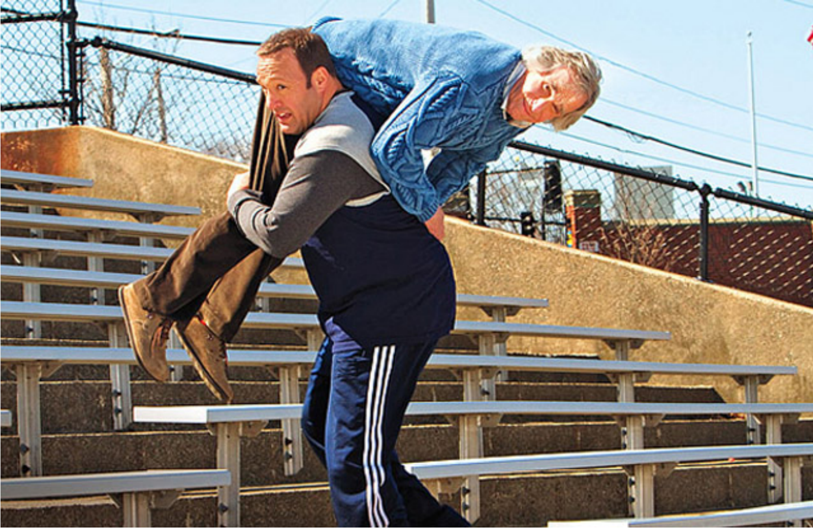
Ayyy!: Scott (Kevin James) Gives Marty (Henry Winkler) a Lift in ‘Here Comes the Boom’