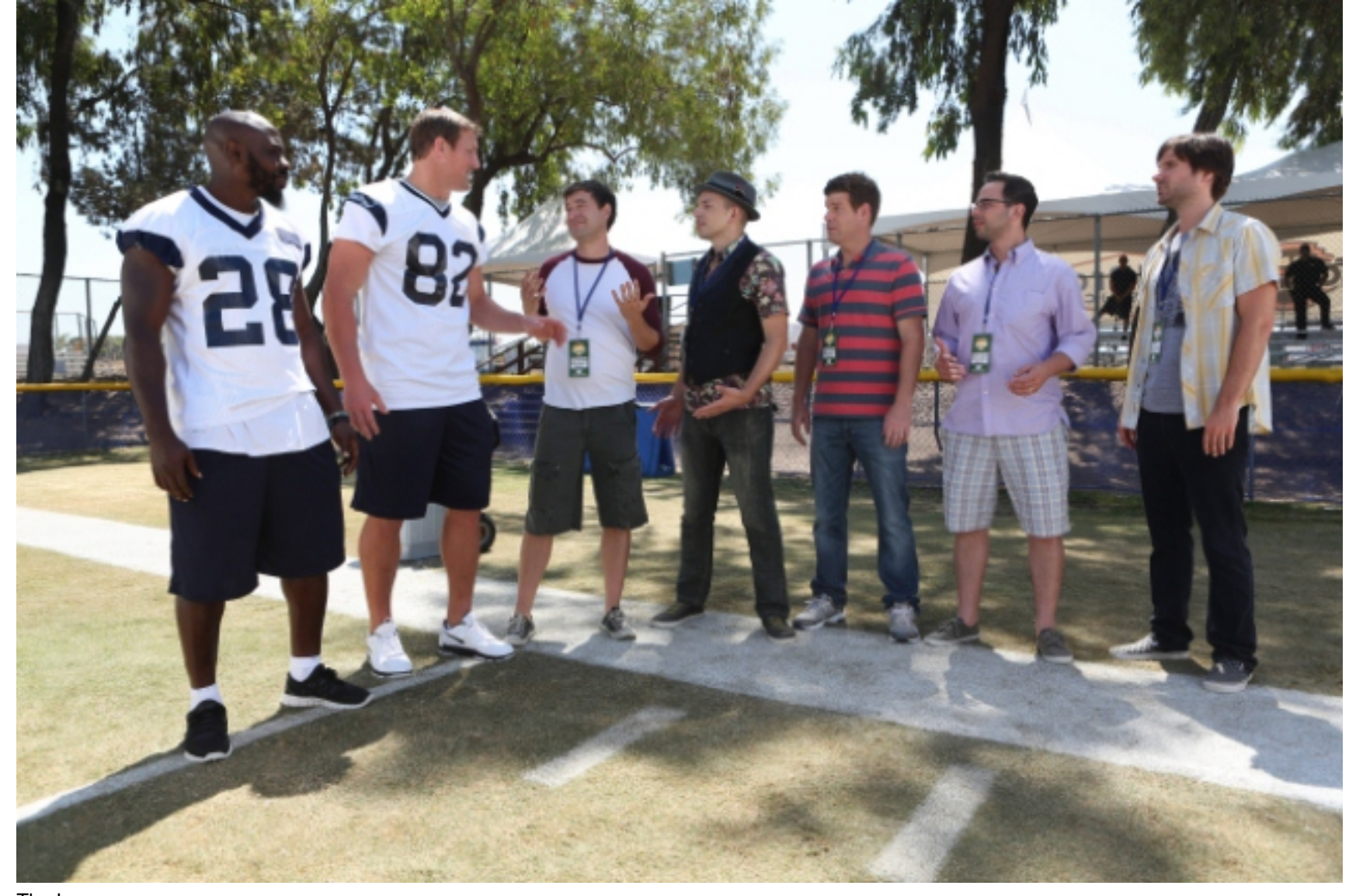
The League

Most comedies that have been on eight years show a little bit of wear and tear and the long-underrated "It's Always Sunny" is no exception. In fact, the gang at Paddy's Pub are fully aware that they're repeating the same ridiculous schemes (it's a theme of both episodes sent for review) and increasingly comment on how they're running out of dumb ideas. The writers of "The League" are luckier in that they're more in the prime of their show, that time period when they can repeat inside jokes for fans and the characters still feel fresh. The episodes of "The League" sent for review, including tonight's premiere, are some of the show's best.