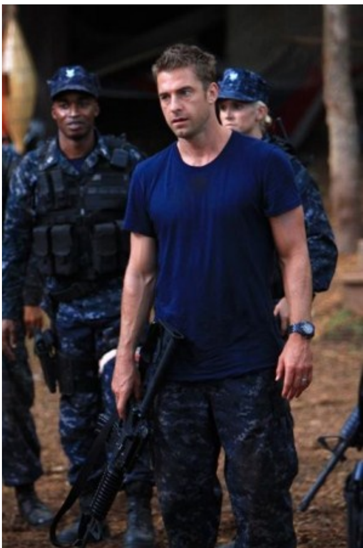
Last Resort

The first episode of "Last Resort" is, understandably, heavy on plot and action but I was curious to see where it would go in episode two. I couldn't be happier with the second episode of this show or more optimistic for the third. The premiere is all about acting — doing what's right in the moment. The second episode is about what comes after that — repercussions, hindsight, regret — and taking the next step. Most importantly, it's about personal connections lost and how we use those to give us strength, to make it matter.