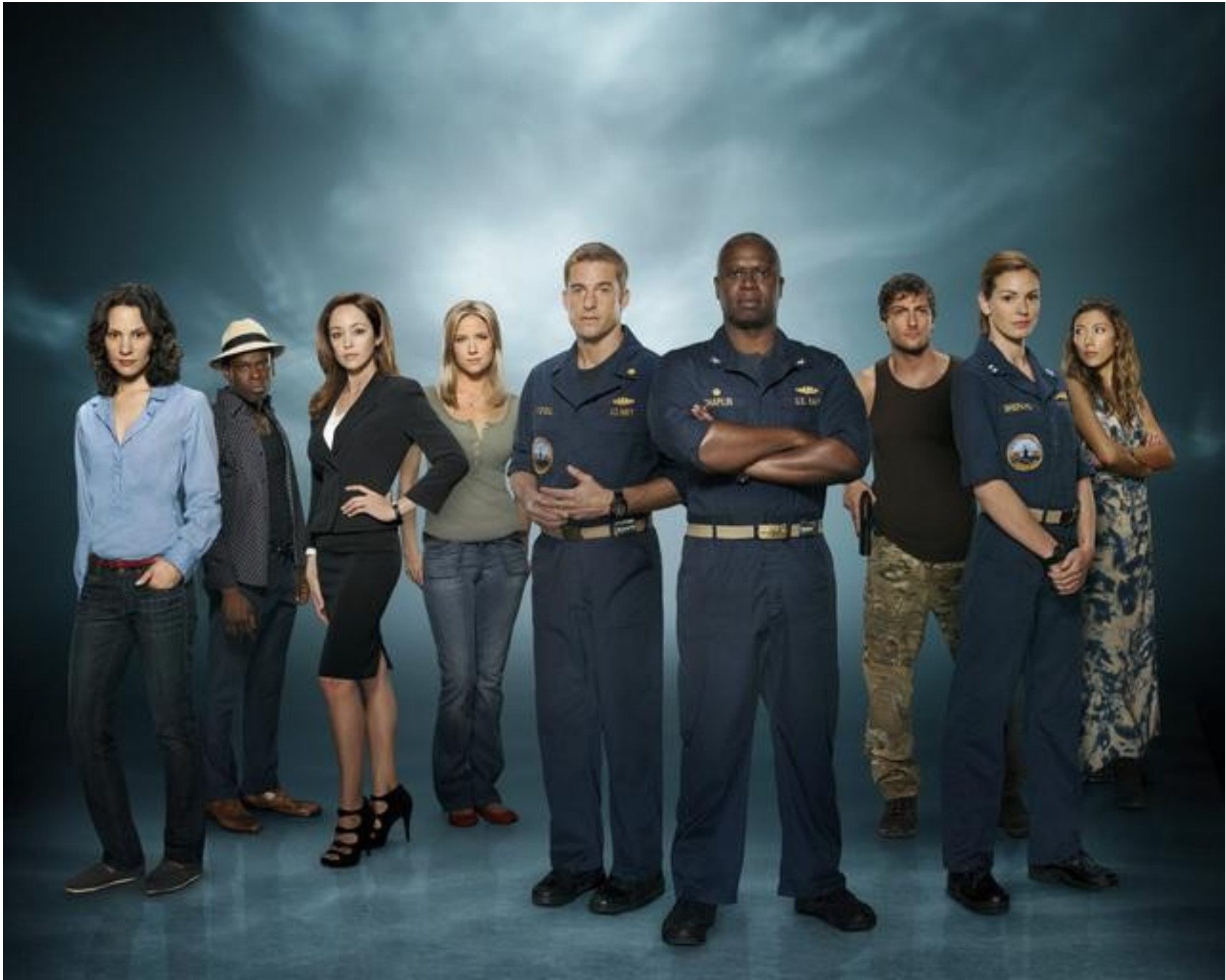
Last Resort

Caught in this moral and practical dilemma are Captain Marcus Chaplin (Andre Braugher) and XO Sam Kendal (Scott Speedman). They question the order through the channel, and before they can even deal with the mutiny about to take place aboard their sub, they are almost immediately fired upon by an unknown enemy. Chaplin and Kendal navigate to a nearby NATO base on a remote island as the planet succumbs to World War III. They have their nuclear weapons. They're not surrendering. They're not moving until they get some answers and clear their names.