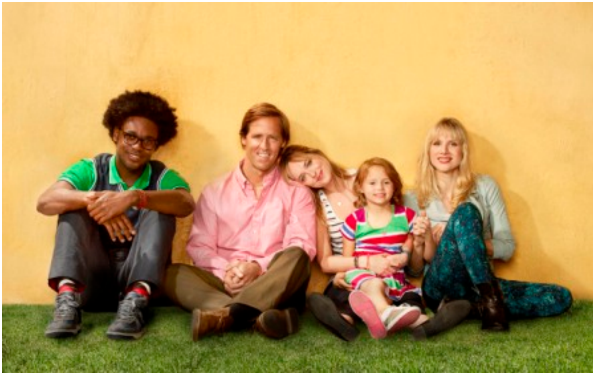
Ben and Kate

In the season premiere, Schmidt (Greenfield) is getting his penis cast off after a summer of celibacy and he's ready to throw a party to celebrate the occasion. Jess (Deschanel) loses her job and ends up trying to be a shot girl at said party where she competes with a great Parker Posey for attention. Winston (Lamorne Morris) gets drunk on girlie drinks made by Nick (Johnson) while Cece (Hannah Simone) introduces the gang to her baffling choice for a new boyfriend. All in all, it's funny, funny stuff, as much so as anything I've seen so far in the new 2012 season.