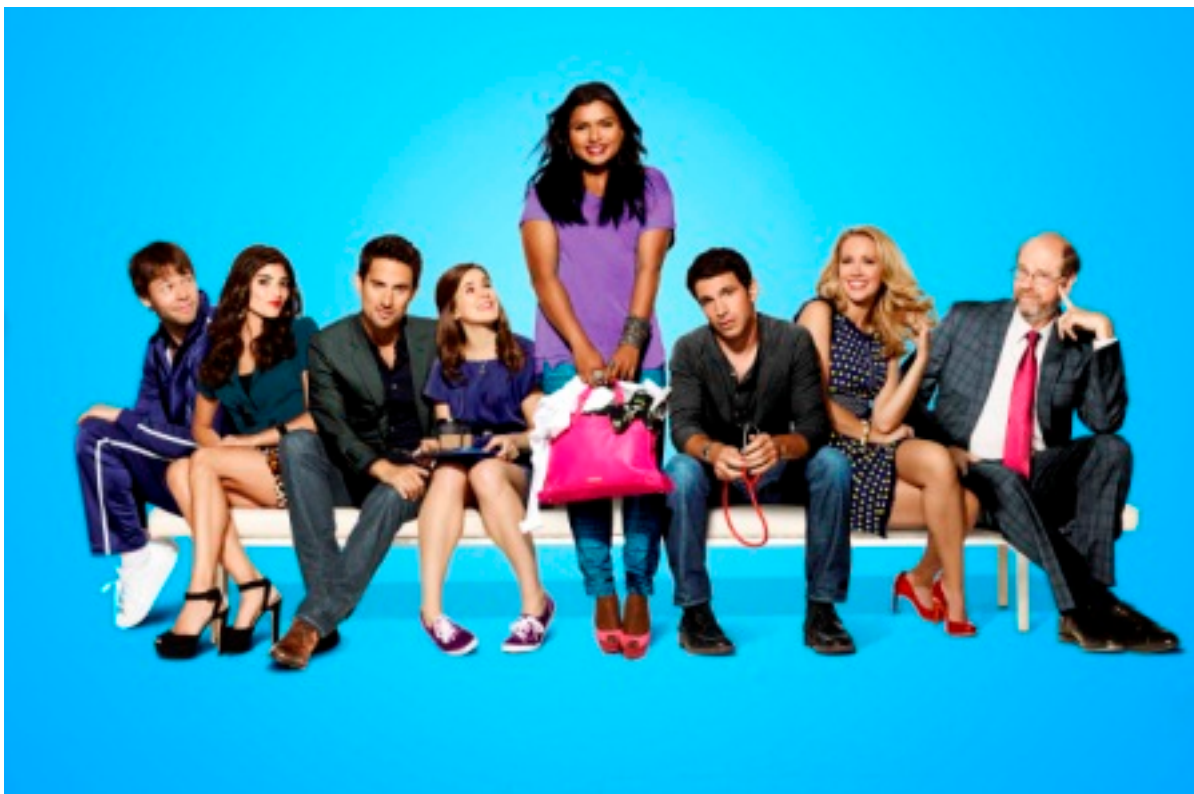
The Mindy Project

The title refers to siblings Ben (Nat Faxon, Oscar-winning co-writer of “The Descendants”) and Kate (Dakota Johnson, daughter of Melanie Griffith & Don Johnson). Kate is a single mother without nearly enough hours in the day. Ben lays around the house a lot. But they love each other and most of the humor comes from that love and their believable chemistry. It helps significantly that Johnson is INCREDIBLY likable. Even as the writing dips into cliché, she makes it easy to root for Kate. I'm rooting for the show all around.