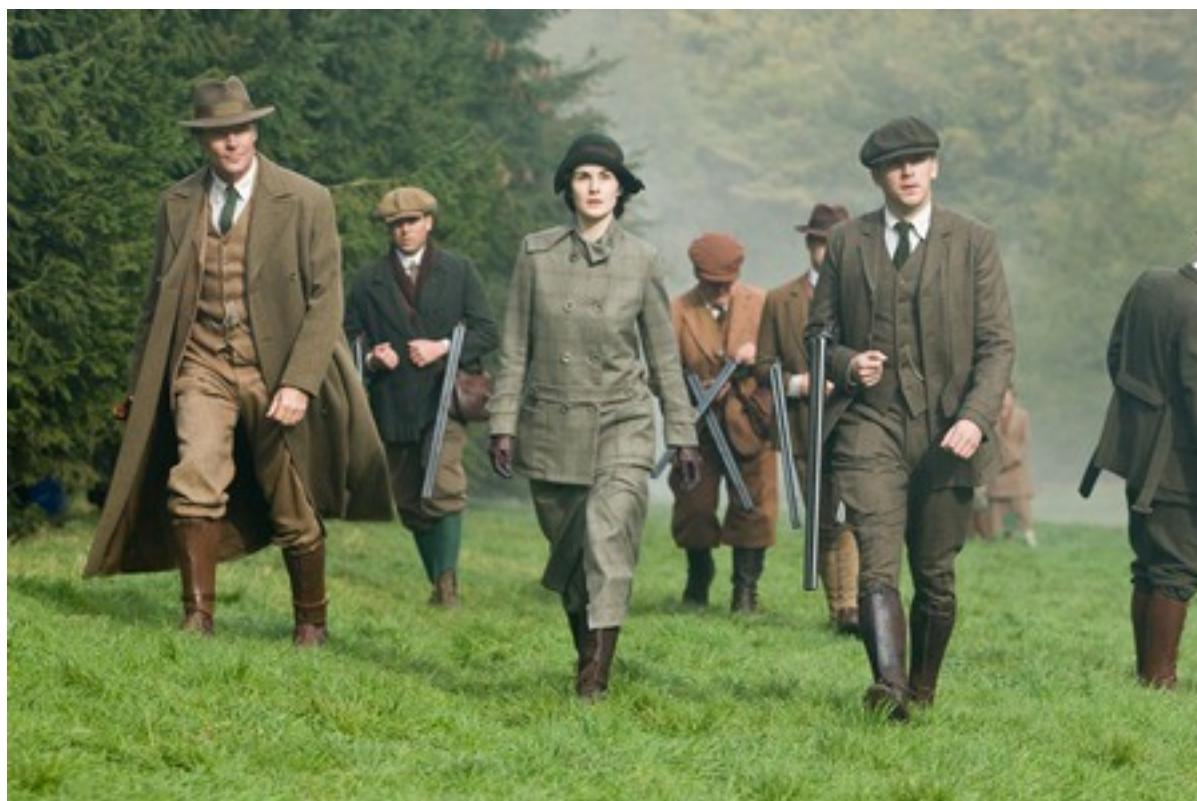
Downton Abbey

CHICAGO – The 64th Annual Emmy Awards will go down on Sunday night and this year promises to be more unpredictable than ever...unless it's not. While most pundits are thinking that this is the year that the Academy will take risks and award new blood, there's just as much of a chance that we'll see as many repeat winners as ever, maybe more. It will probably be a healthy mix of the two with new winners like Deschanel & Danes joining returning favorites like Cranston & Parsons. How's it all going to end? No one knows for sure (but come back Sunday night for all the winners). Here's my best guesses along with what should win and what should have been nominated.