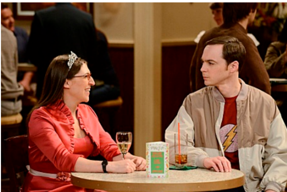
The Big Bang Theory

Should Have Been Nominated: “Louie” (FX)