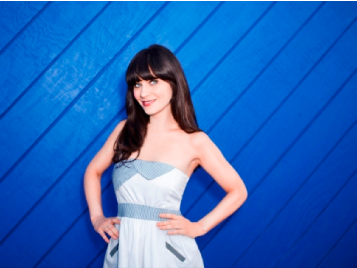
New Girl