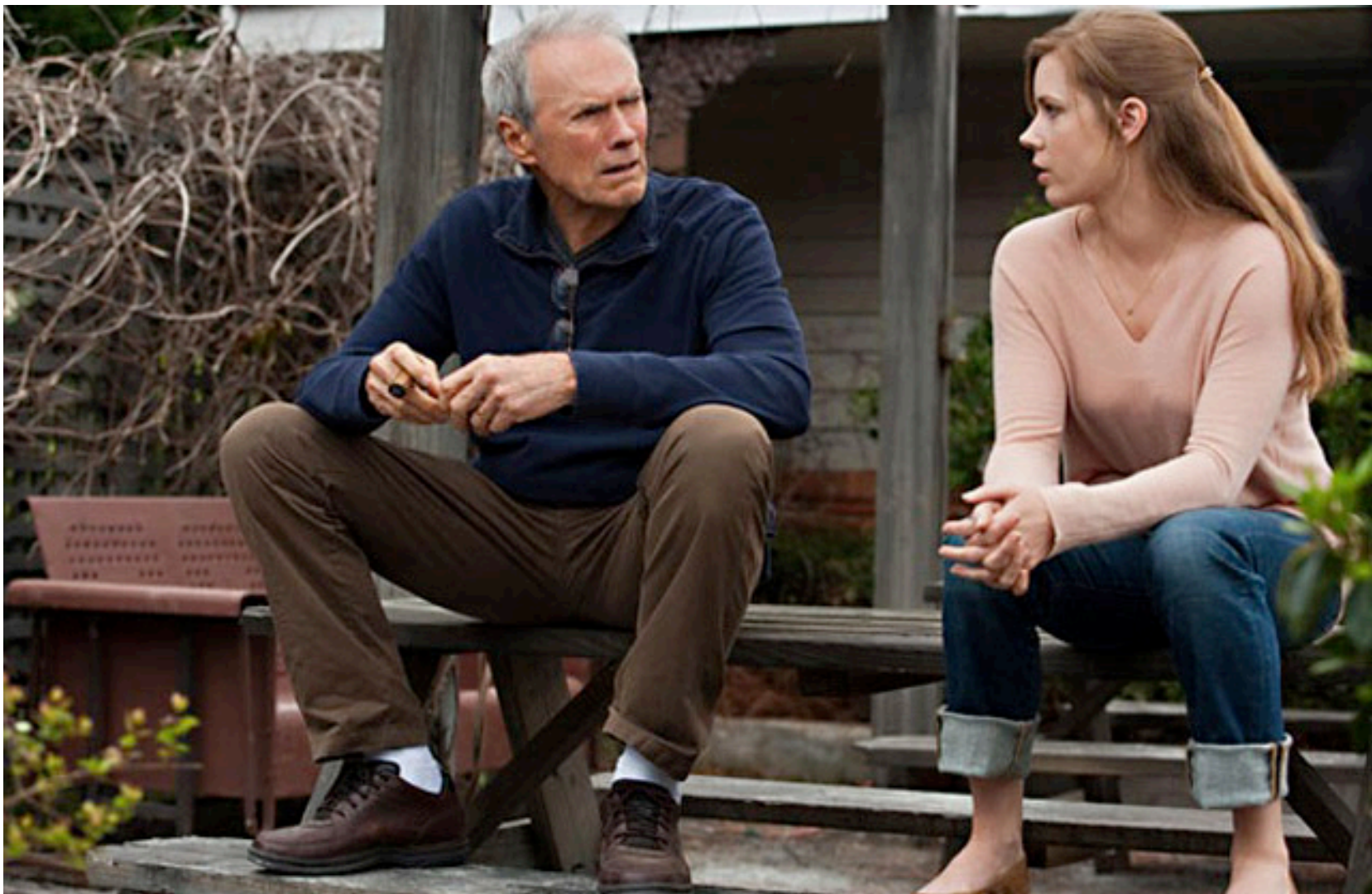
Gus (Clint Eastwood) Connects with his daughter Mickey (Amy Adams) in ‘Trouble with the Curve’