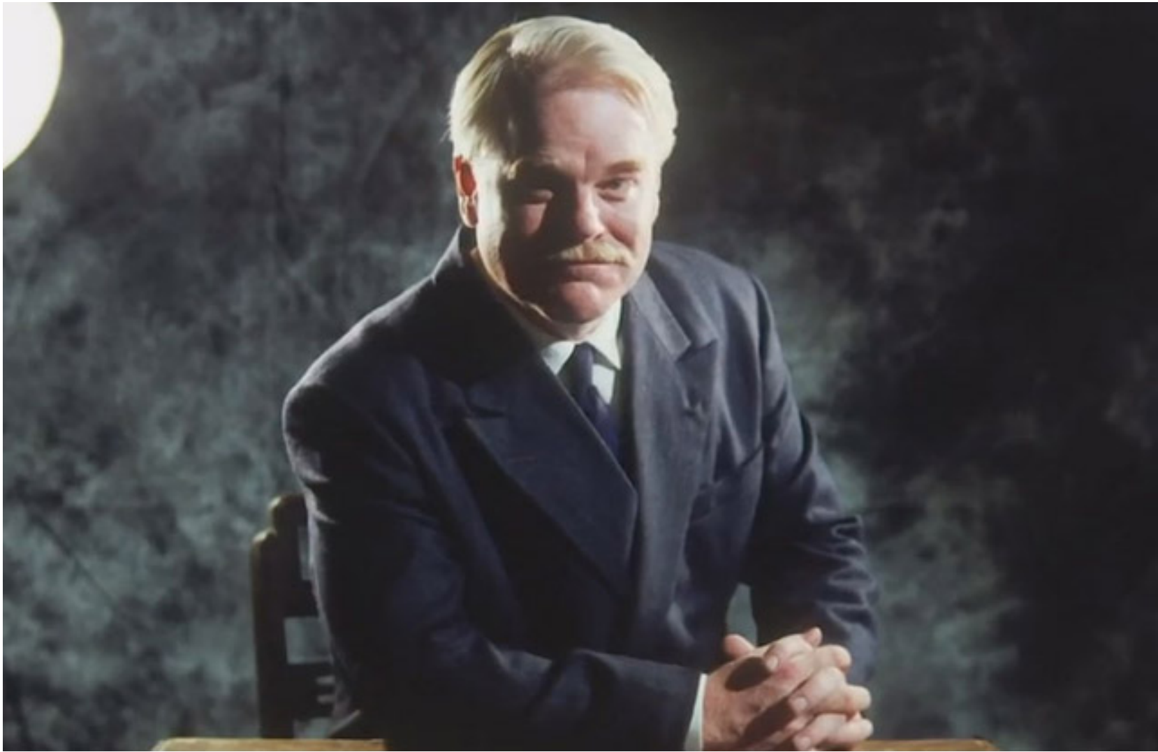
Philip Seymour Hoffman as Lancaster Dodd in 'The Master'