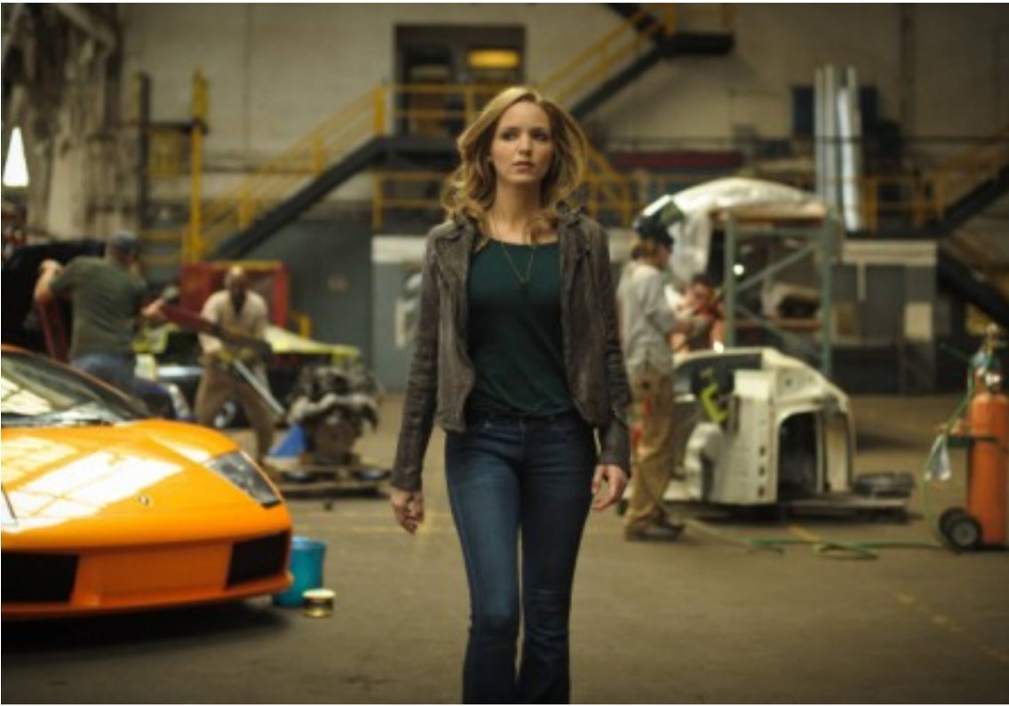
The Mob Doctor

The mob half of “The Mob Doctor” is only part of the plotting as Grace has a medical drama cliché quota to fulfill at the hospital where she has a best friend (Floriana Lima), boyfriend (Zach Gilford), tough-but-supportive boss (Zeljko Ivanek), and rival (Jaime Lee Kirchner). The hospital drama plays just as unbelievably as the mob stuff but it’s the graft of the two that really suffers.