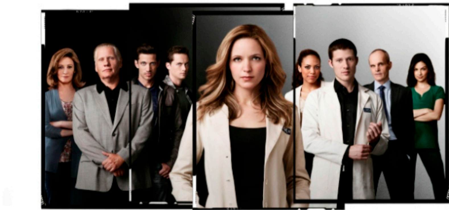
The Mob Doctor

However, “The Mob Doctor” would have difficulty finding an audience in the best time slot on TV simply because it’s dramatically uninteresting and essentially pretty insulting to your intelligence. About five minutes in and this Chicago resident was rolling his eyes at yet another cliched portrayal of the criminal underworld of the Windy City, this time with a medical twist. The foundation of “The Mob Doctor” is not that ridiculous in that there could be an interesting character drama written around how nefarious underground types get the medical attention they need. This is not that show. This is a soap opera disguised as something else and most soap writers would say its plotting was ridiculous and its characters were two-dimensional.