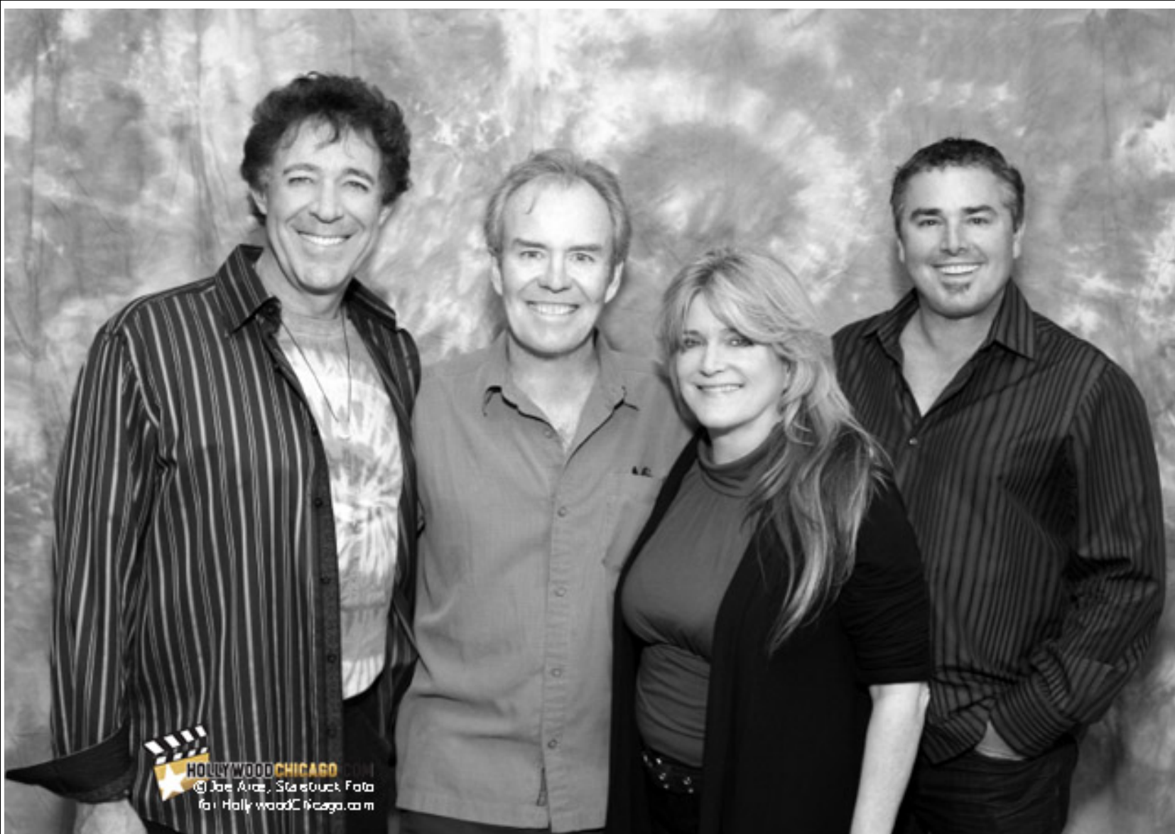
Barry Williams, Mike Lookinland, Susan Olsen and Christopher Knight at ‘The Hollywood Show,’ March of 2012