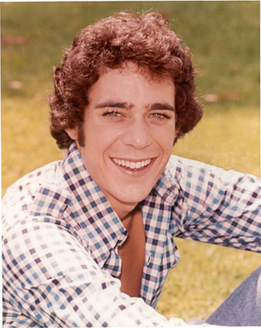
Barry Williams as Greg Brady

HollywoodChicago.com: What was the attitude towards your TV career in your real family, and did you find it strange that you were in essence participating in two families?