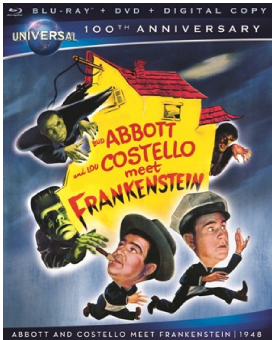
Abbott and Costello Meet Frankenstein

In alphabetical order (star rating takes into account transfer & special features along with the film itself):