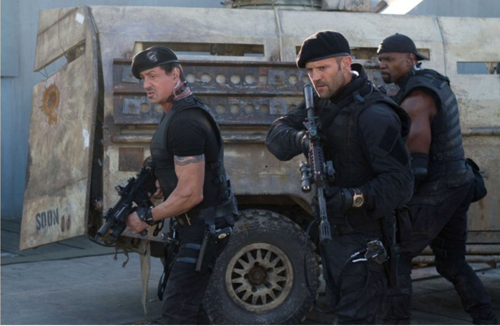
Ross (Sylvester Stallone), Christmas (Jason Statham) and Caesar (Terry Crews) in ‘The Expendables 2’