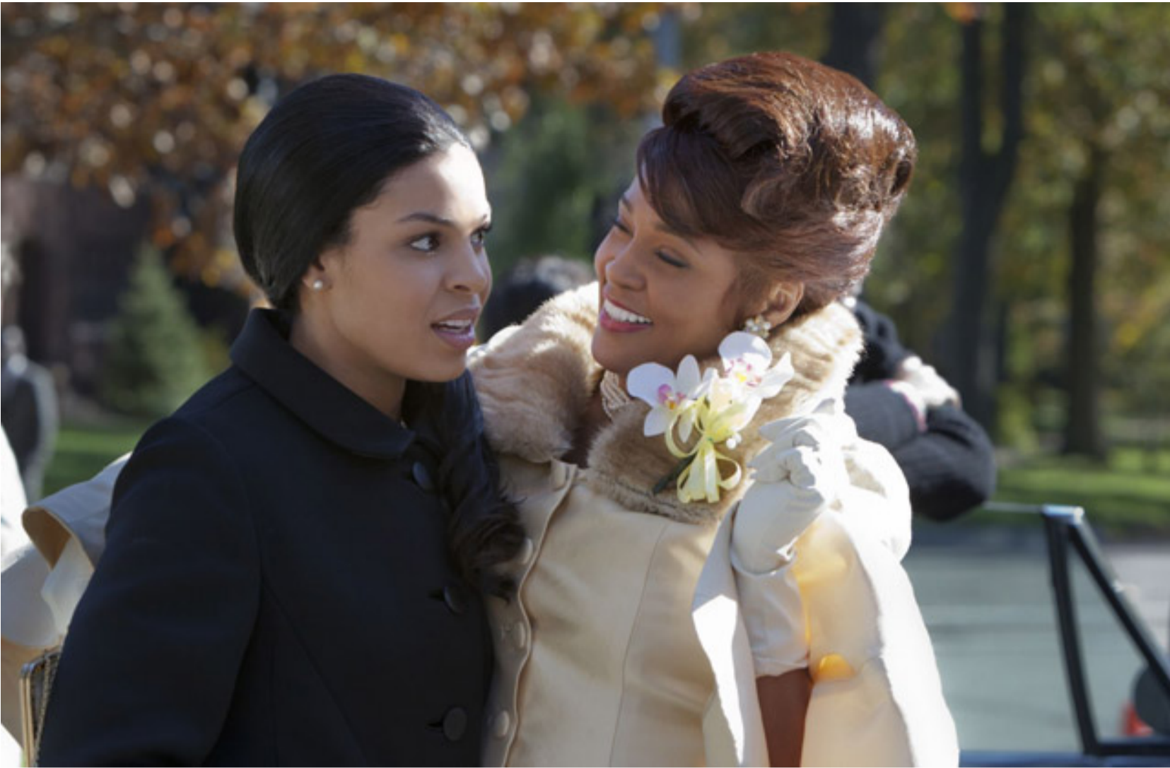
Sparkle (Jordin Sparks) and her Mother Emma (Whitney Houston) in ‘Sparkle’