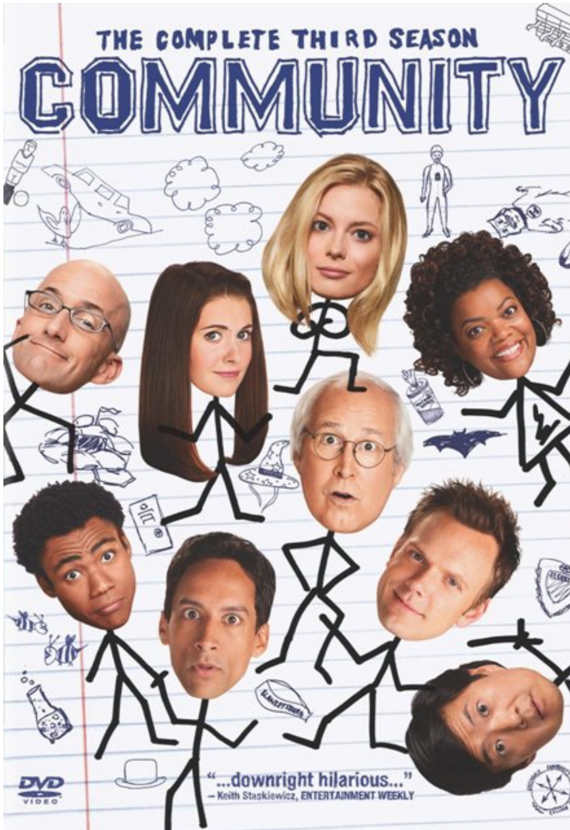
Community Photo credit: Sony