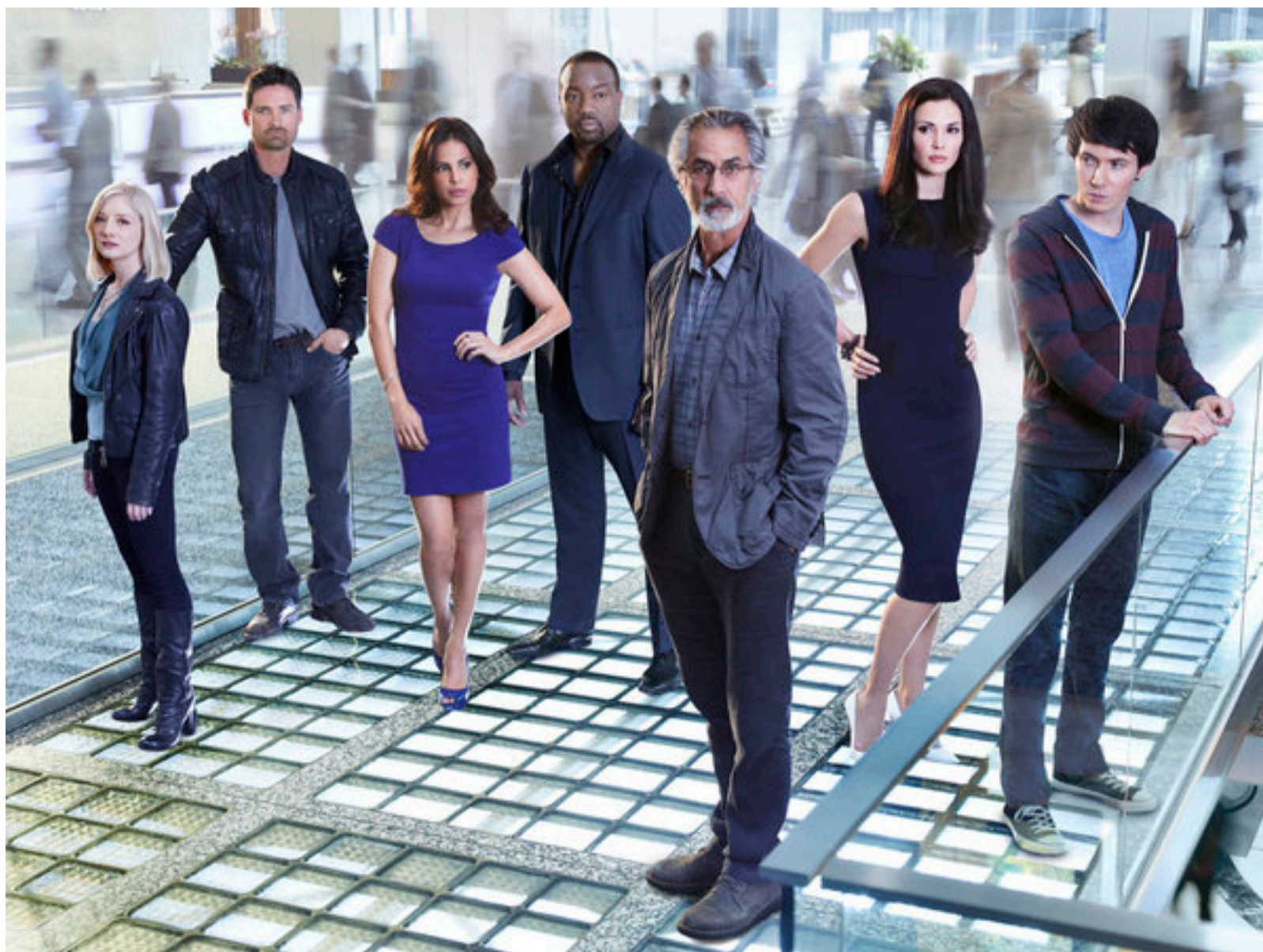
Alphas

"Alphas" felt a bit too familiar in season one as memories of "Heroes" and "The 4400" dominated my feelings about the series premiere. Revisiting the first season on the recently-released DVD set (the details of which you'll find at the bottom of this review), I was impressed at how the show built its own confident identity as the freshman season went along. That confidence remains as the show tries to defy the sophomore slump with an action-packed season two premiere about a world shaken up by the attempted control of people who aren't like everyone else.