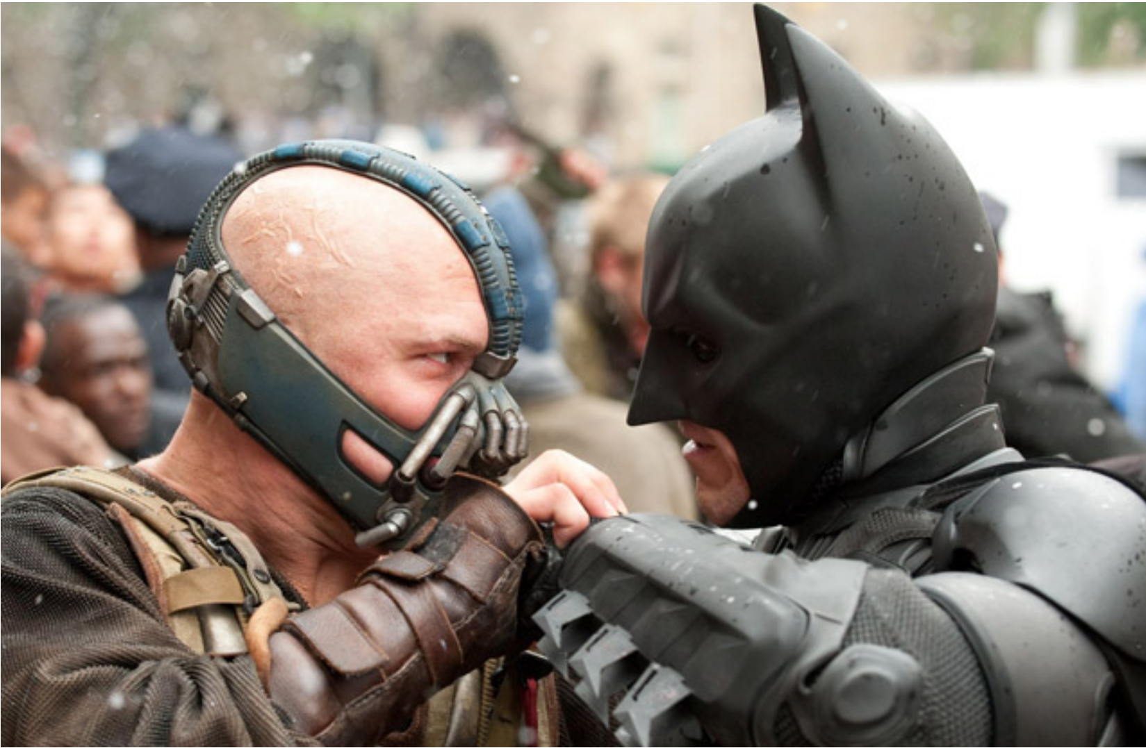
Confrontation: Bane (Tom Hardy) and The Batman (Christian Bale) in 'The Dark Knight Rises'