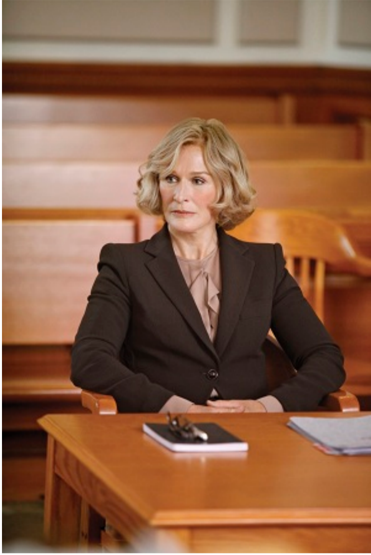
Damages

And it's not just the jaw-dropping finale of the season premiere of "Damages" that feels like a step up and a stage-setter for a great final run. The whole cast seems reinvigorated by the premise of the season, one that gets Ellen (Rose Byrne) and Patty (Glenn Close) playing legal games against each other in the way they've been promising for years. Does Ellen have the cutthroat potential of her mentor? The flashback structure remains — in which we see a few mysterious scenes from present day and the majority of the season is in flashback — and seems to foretell tragedy but you never know what you're seeing on "Damages."