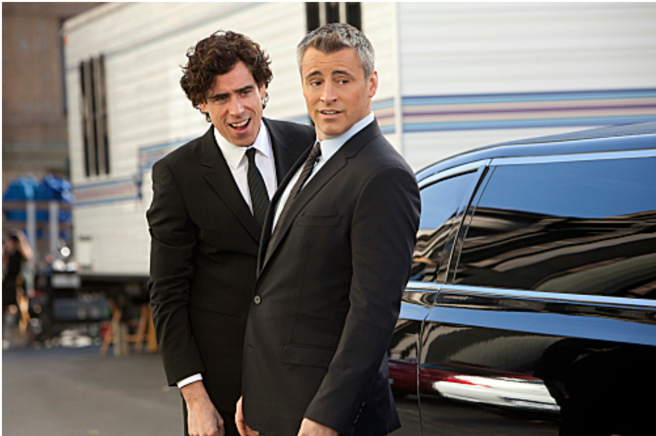
Episodes

And this is the focus of season two of “Episodes” as Mangan’s writer Sean Lincoln and his wife Beverly (Tamsin Greig) watch as their program “Pucks!” with Matt LeBlanc (who brilliantly plays himself) gets destroyed in the ratings by a show with a talking dog. While the first season of “Episodes” was about the pre-production process of getting a show from the U.K. to an American pilot, the second season is about what happens next as producers start to meddle in an attempt to stop eroding ratings before the cancellation axe swings.